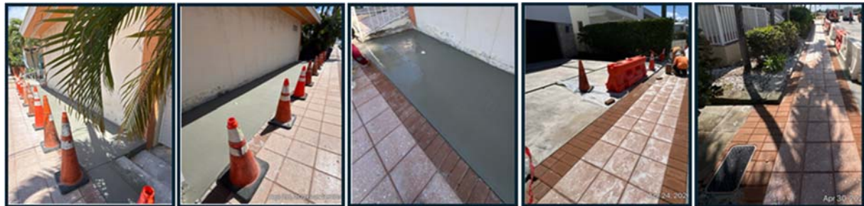
Harmonization on Jackson Streets

Right-of-entry agreements distributed to approximately 90% of the residents, and most agreements from Harrison to Oregon Streets have been collected. Harmonization on Van Buren, Virginia, Georgia, and Jackson Streets completed.