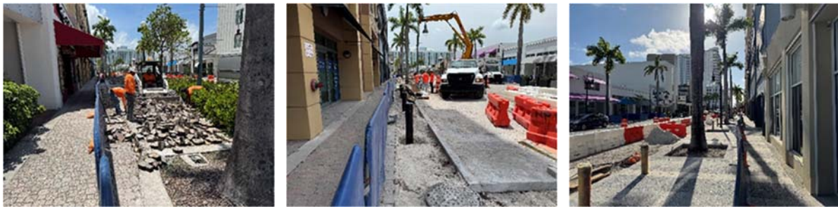
Phase V – Construction activities

Construction in Phase V began on May 4, 2026. Demolition activities began along 20 th Avenue and are moving eastward. Tree pit and bollard installations are 80% complete. Installation of light poles and fixtures is complete. Paver installation is close to 40% complete.