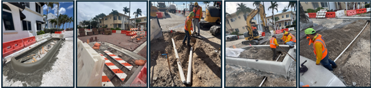
Jackson Street – transformer island layout and FPL equipment “stub up”

Underground infrastructure also includes Comcast, AT&T, and Crown Castle utility companies.