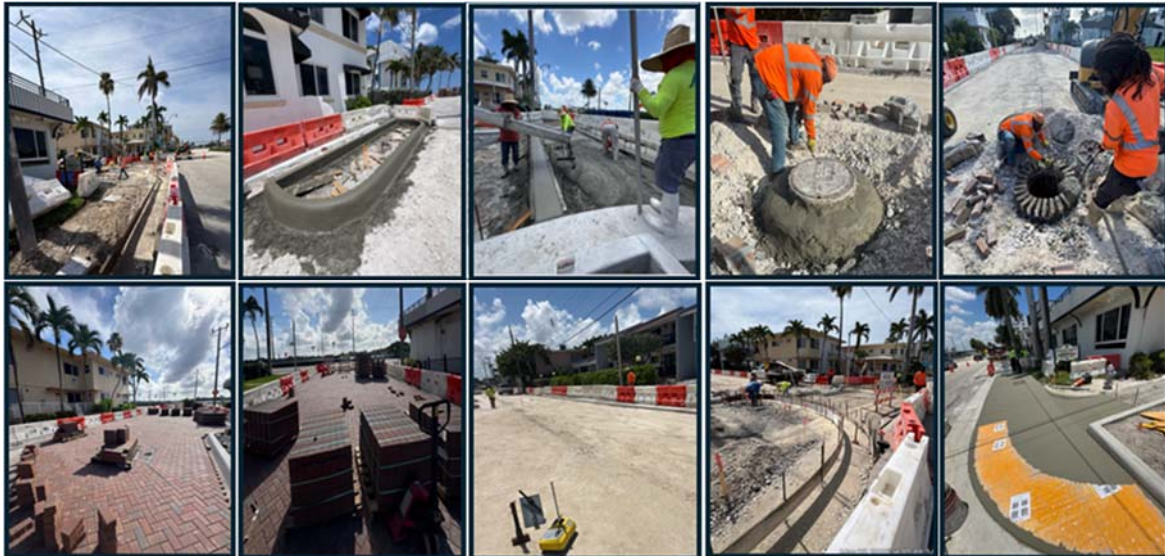
Demolition, filling, grading, compacting, concrete work, and laying pavers on Jackson Street

Roadway construction on Van Buren, Virginia, and Georgia Streets is complete. Jackson Street sidewalks are complete; roadway construction is underway with estimated completion second week in June 2026. Street closed to vehicular traffic, pedestrian access remains open at all times. Surf Road reconstruction to begin May 26 th from Harrison to Van Buren Streets, estimated completion June 18 th , followed by segment from Van Buren to Virginia Streets. Light poles installed where there are no conflicts with overhead power lines on Van Buren, Virginia, Georgia, and Jackson Streets.