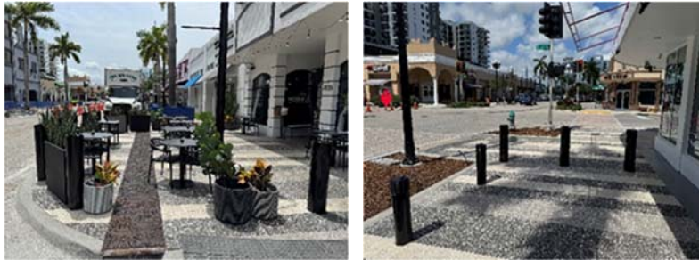
Phase IV – Substantially complete

Construction in Phase IV was substantially completed on April 24, 2026. The sidewalk and roadway have been reopened to both pedestrian and vehicular traffic. However, installation of Flexi-Pave at tree pits, and installation of festoon lighting will take place at a later date.