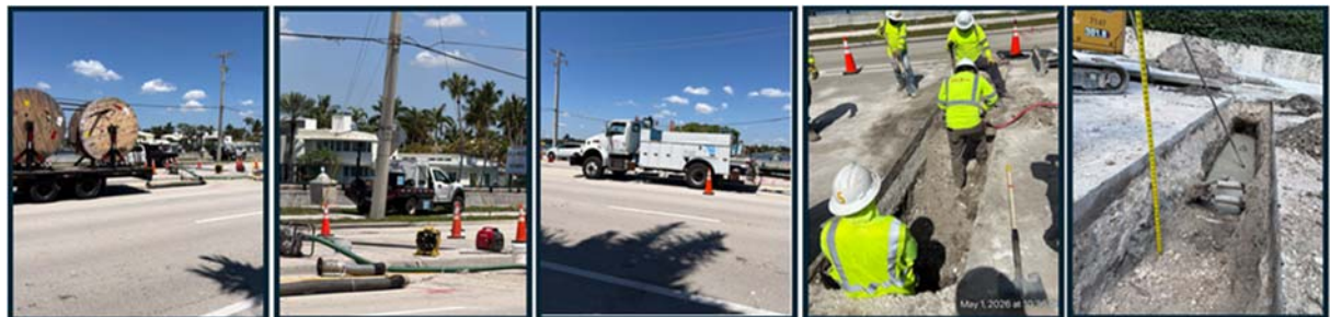
Horizontal Directional Drilling at A1A for electrical infrastructure and undergrounding work

Horizontal directional drilling (HDD) for conduit main service lines currently underway along SR A1A. A Florida Department of Transportation (FDOT) single-lane closure is in effect daily from 9:00 a.m. to 4:00 p.m. within active work zones. Contractor completed directional boring operations along the east side of SR A1A, from Harrison Street to Hallandale Beach Blvd., and is now performing excavation and conduit pullback activities in this segment. Work is transitioning to the west side of SR A1A, where HDD operations will continue northbound along the outer lane. Contractor installing conduit across the Magnolia Terrace surface parking lot. Due to ongoing FDOT pump construction between Jefferson Street and Crocus Terrace, this segment has been temporarily bypassed and the contractor will return to complete work in this area at a later date.