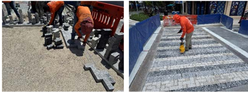
Hollywood Blvd. Streetscape – crosswalk mock-up

Contractor completed warranty repairs of the pedestrian crosswalk on the south side of the intersection at 20 th Avenue and Hollywood Blvd. This crosswalk will serve as a mock-up showcasing a new design, featuring 8"x4" pavers in colors that match the sidewalk pavers, arranged in a herringbone pattern. At the request of the Downtown business community, the remaining damaged crosswalks along the Boulevard will be reconstructed in late Summer 2026, after the high season concludes.