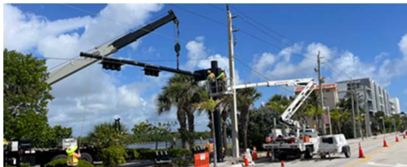
Mast arm installation

Materials purchased and currently stored in contractor's yard. FPL overhead power lines are shut north of Cleveland Street (all properties north of Cleveland St. are currently powered through the new underground system). Electrical infrastructure completed. Foundation and mast arm installed. Pedestrian activated signal is scheduled to be completed October 2026. Traffic Signal cost is 50/50 with Oceanside Marina (Marriott Hotel).