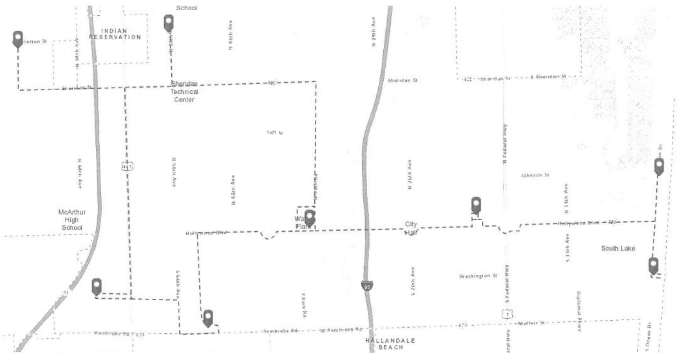
Designated Drop-off/Pick up locations for the Fixed Route pilot test