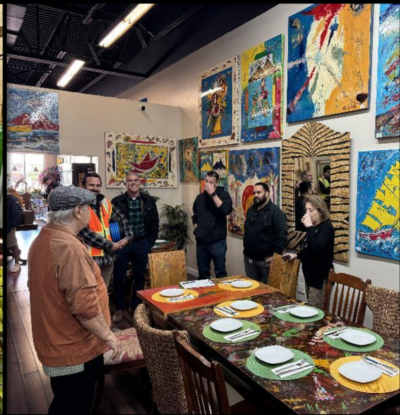
Coffee with the Crew at Social Room, Elixir Kava Bar & Sasa Italian Gourmet