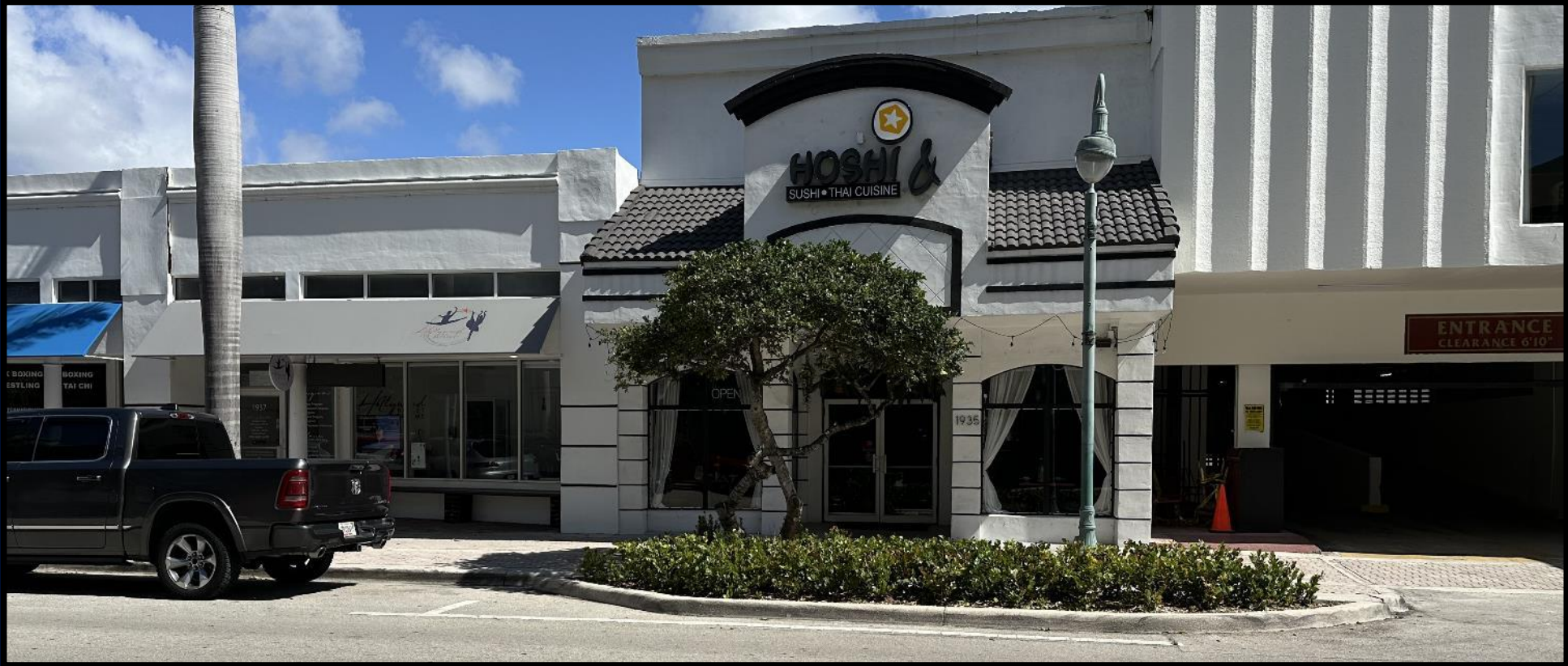
Existing conditions in front of Hoshi & Sushi Thai Cuisine