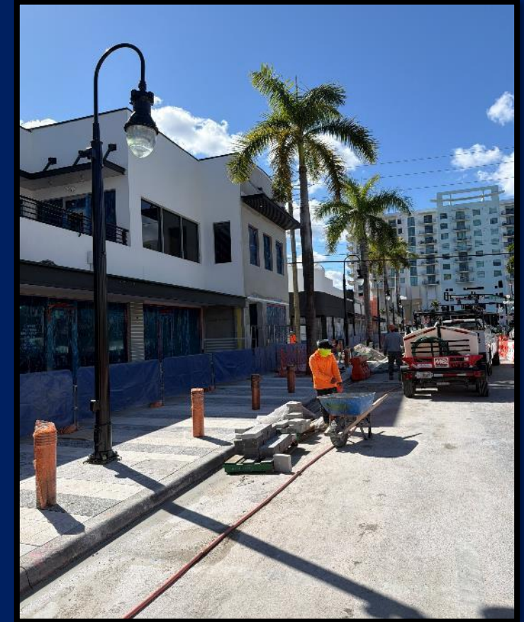
New Flexi-Pave tree pits, decorative lighting, and Bridal Veil tree plantings contribute to the transformation of Harrison Street.