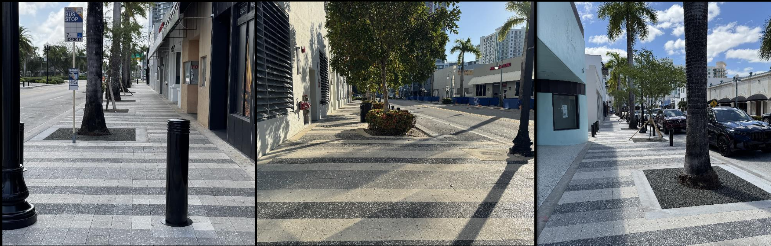
Substantially Completed Streetscape at Phase 1, 2 & 3