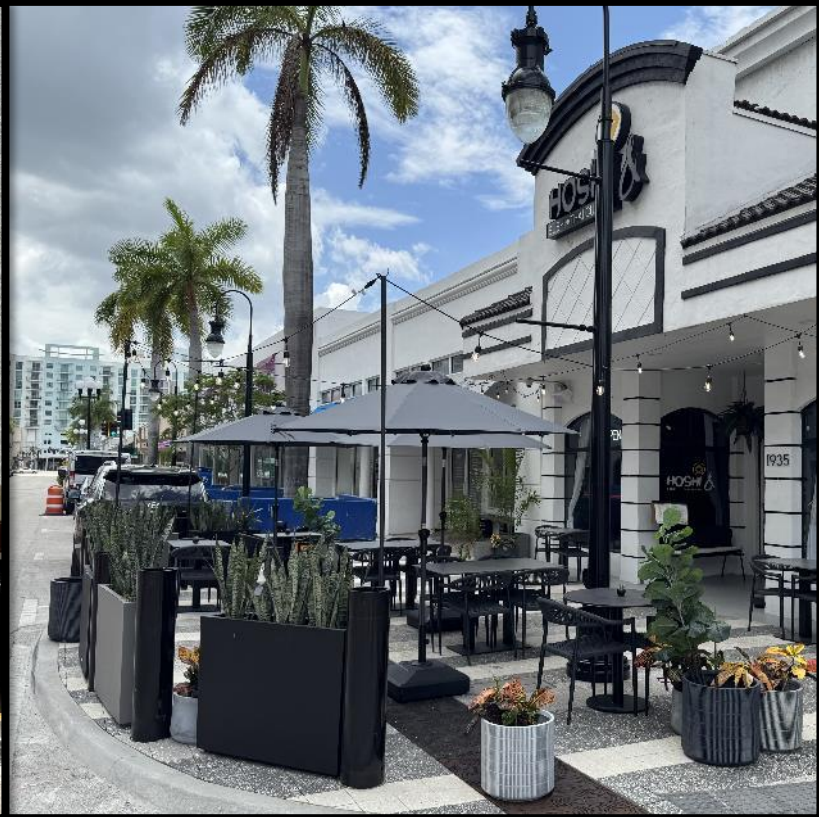
New sidewalk extension and outdoor seating area completed in front of Hoshi & Sushi Thai Cuisine as part of the Phase 4 improvements.