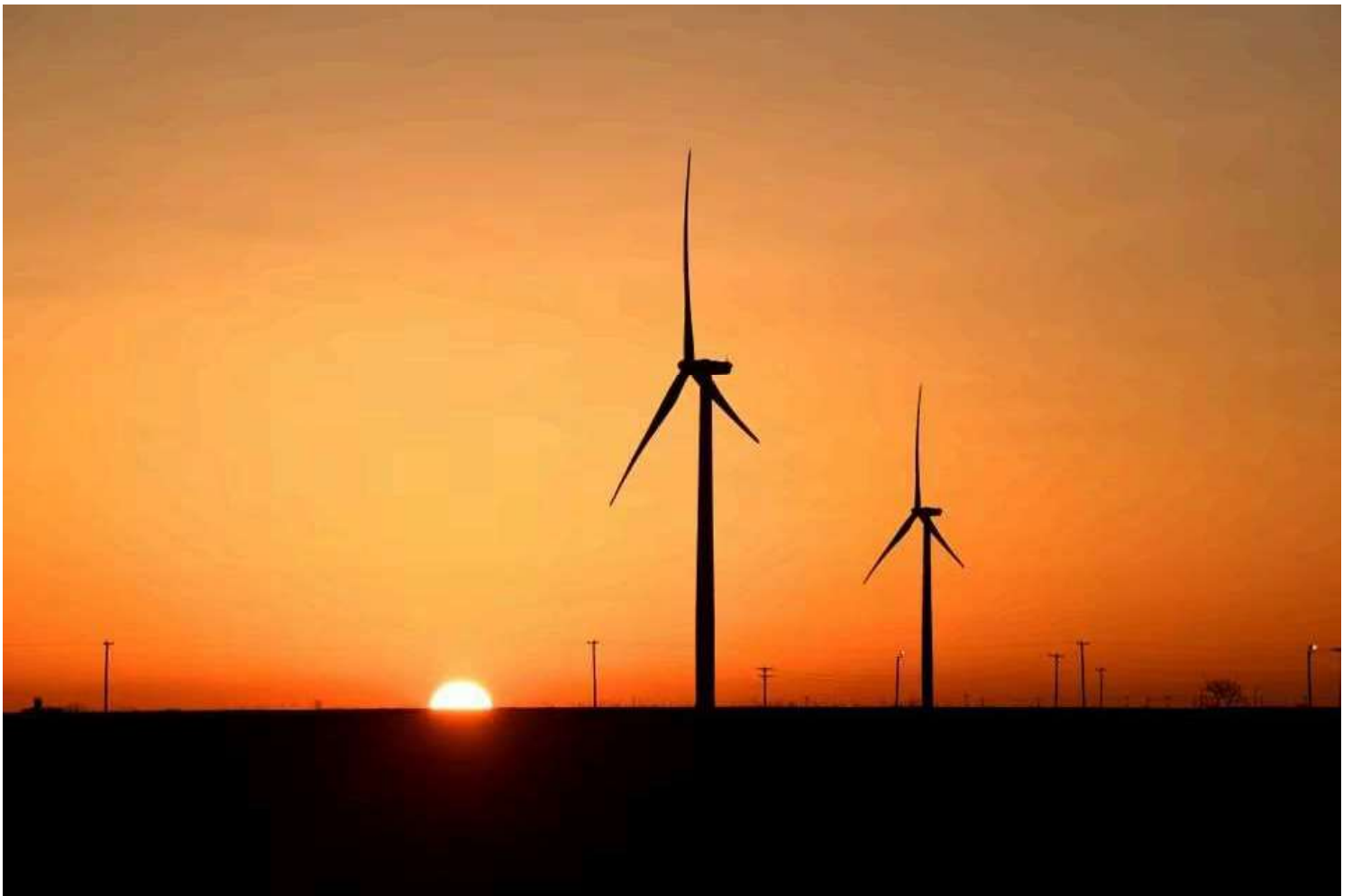
Wind turbines operate at sunrise in the Permian Basin oil and natural gas production area in Big Spring, Texas, U.S., February 12, 2019.