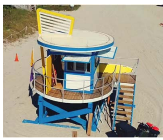
First Aid Station