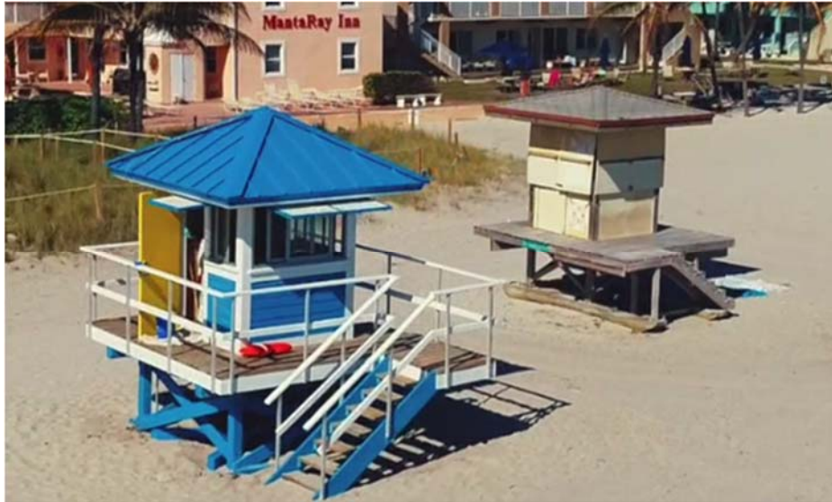
New and old Lifeguard Towers

The table below is a list of units and their current status: