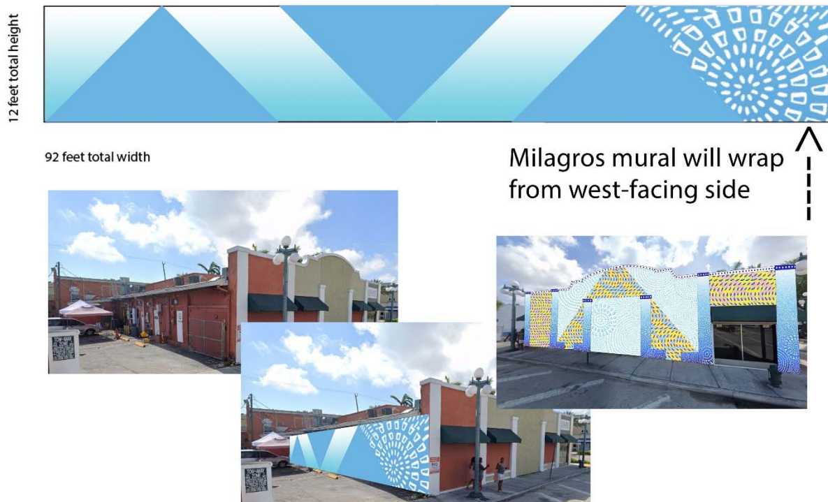
Rendering of upcoming mural at 2051B Hollywood Blvd.