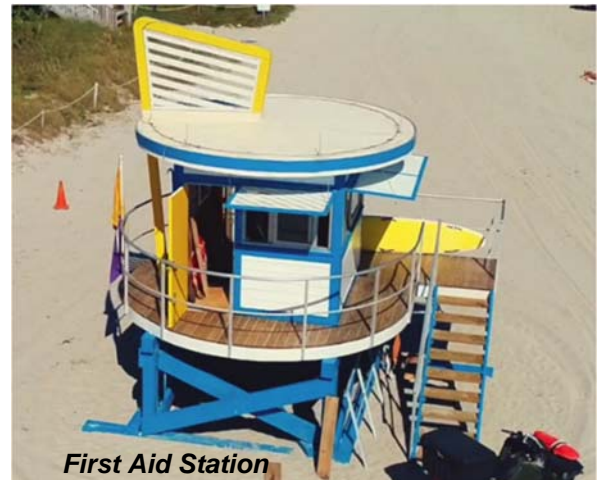
First Aid Station