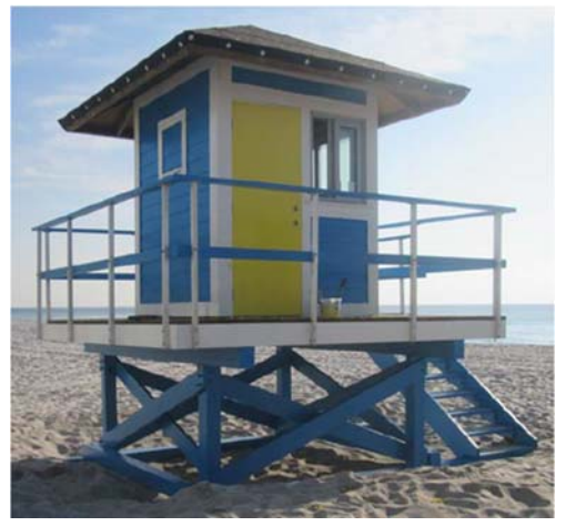
Paint application, Lifeguard Tower