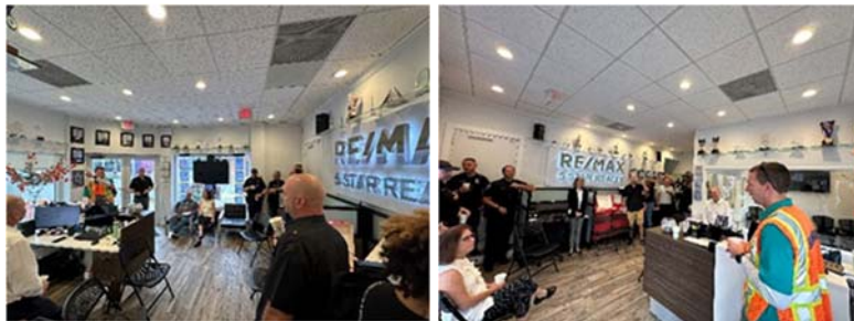
"Coffee With The Crew" Eight – January 25 th at 1903 Harrison Street