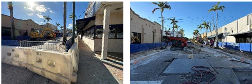
S. 20 th Avenue: MOT and demolition