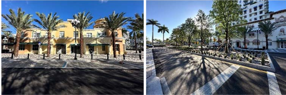
Phase 3 & 4 Substantially Completed

The north side of the Boulevard was substantially completed and reopened to the public and vehicular traffic on December 22 nd . The south side of the Boulevard was substantially completed and reopened to the public and vehicular traffic on January 10 th . The installation of shrubs within the center median and landscape islands is on-going. The final lift of asphalt and striping will take place closer to the end of the project.