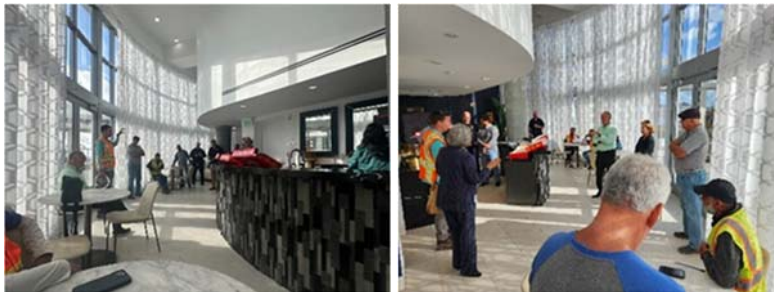
"Coffee With The Crew" Seven - November 30 th at 1818 Hollywood Blvd.