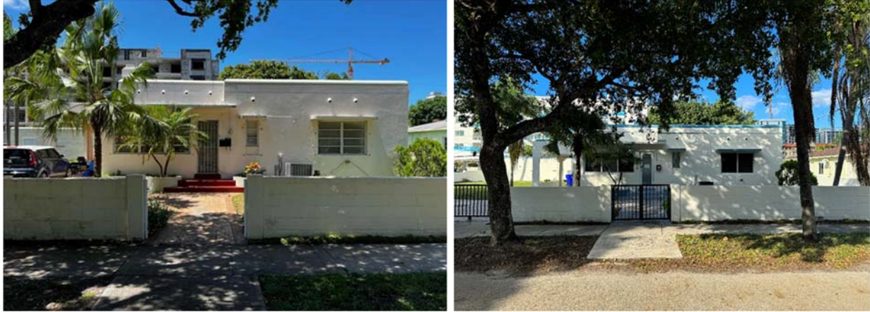
1833 Madison Street Before & After Improvements