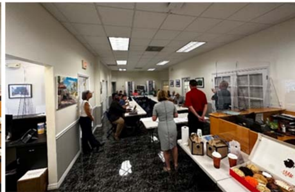
First Downtown Stakeholders Pre-Construction Meeting – March 7, 2023