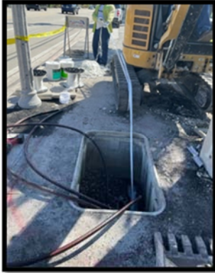
Electrical cable installation