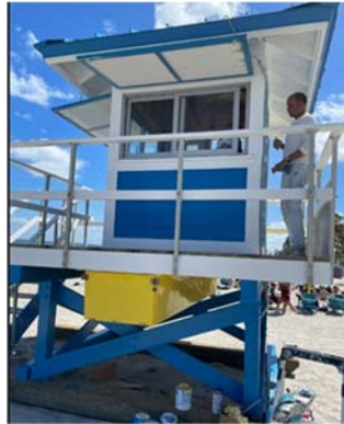
Grant Street LGT