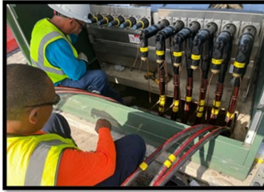
Wiring FPL unit