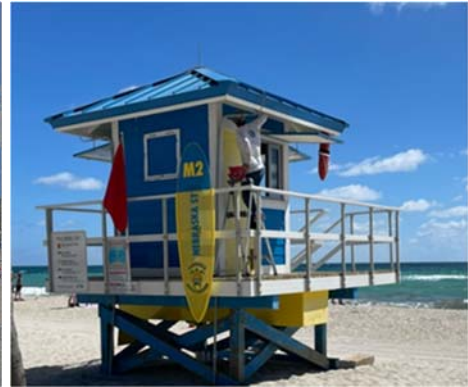
Nebraska Street LGT