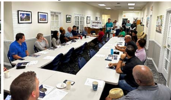
Second Downtown Stakeholders Pre-Construction Meeting – March 28, 2023