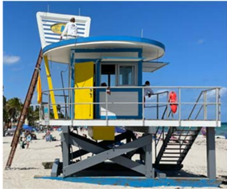
Cleveland Street FAS