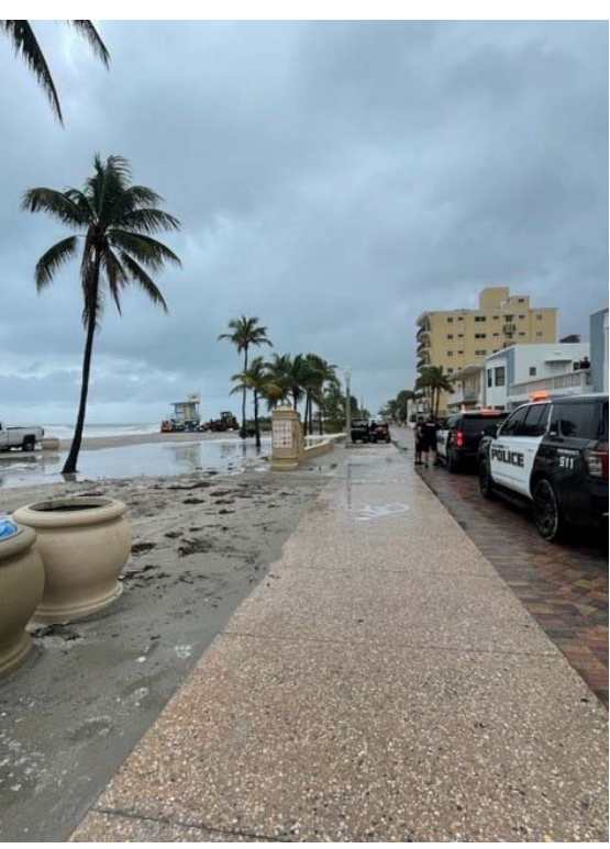
In December, 1,548 operational hours were clocked by Beach Maintenance staff. Of those hours, 1,284 were dedicated to trash removal from the beach, and 112 hours were spent cleaning the shower areas. Graffiti tags and stickers were removed from 10 locations.