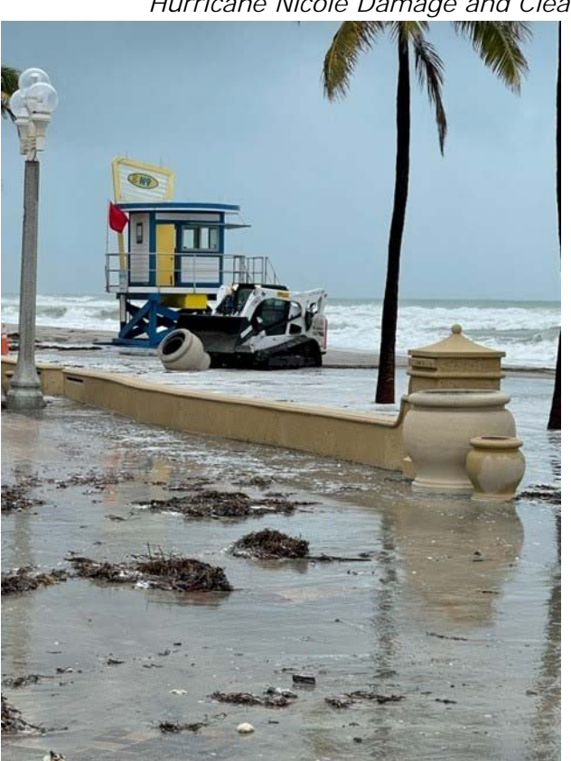
Hurricane Nicole Damage and Cleanup - November 9 & 10

Beach - In November, 1,557 operational hours were clocked by Beach Maintenance staff. Of those hours, 1,200 were dedicated to trash removal from the beach, and 112 hours were spent cleaning the shower areas. Graffiti tags and stickers were removed from 10 locations.