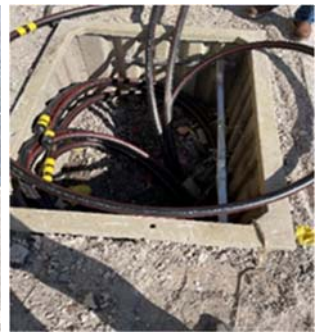
Pulling underground primary cable and electrical wiring at various locations.