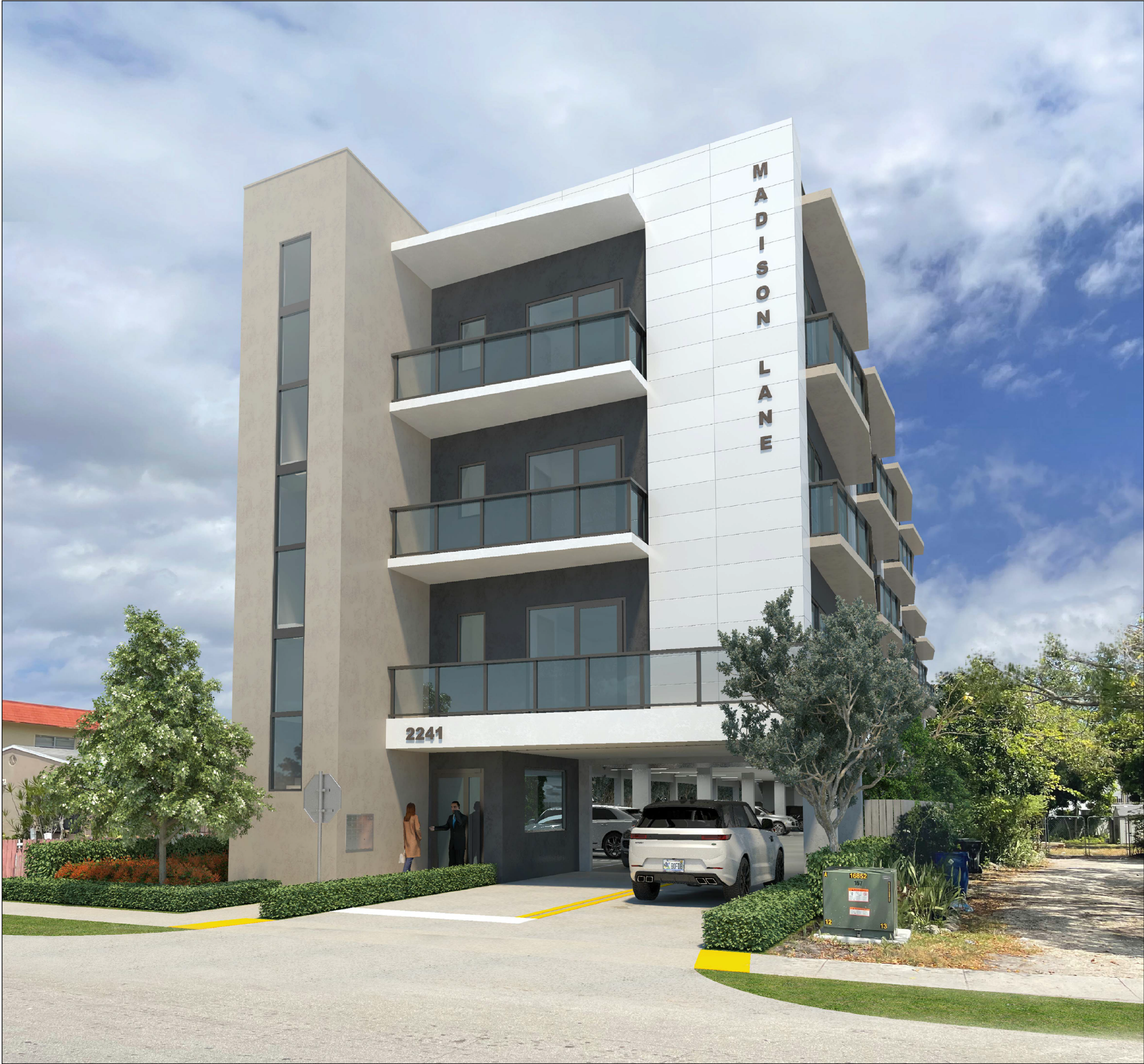
RENDERING OF THE PROPOSED BUILDING FROM MADISON ST