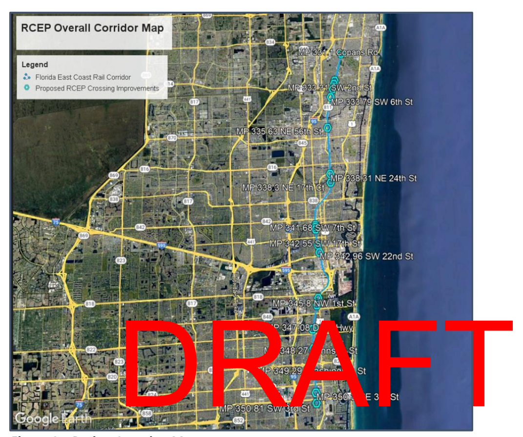
Figure 1 - Project Location Map