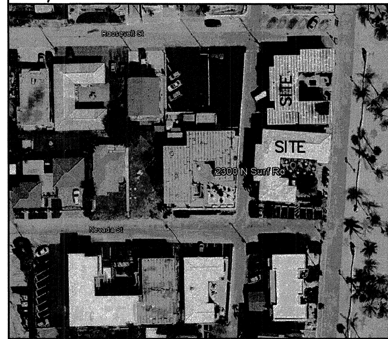
LOCATION SKETCH NOT TO SCALE

STREET ADDRESS: 2300 Surf Rd., Hollywood, FL. ID# 5142 12 01 1730 2325 Surf Rd., Hollywood, FL. ID# 5142 12 01 1720 ID# 5142 12 01 1721 ID# 5142 12 01 1722 Parking lot on Nevada St., Hollywood, FL. ID# 5142 12 01 1690