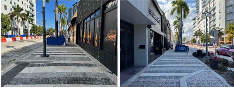
Phase I – Completed Paver Installation