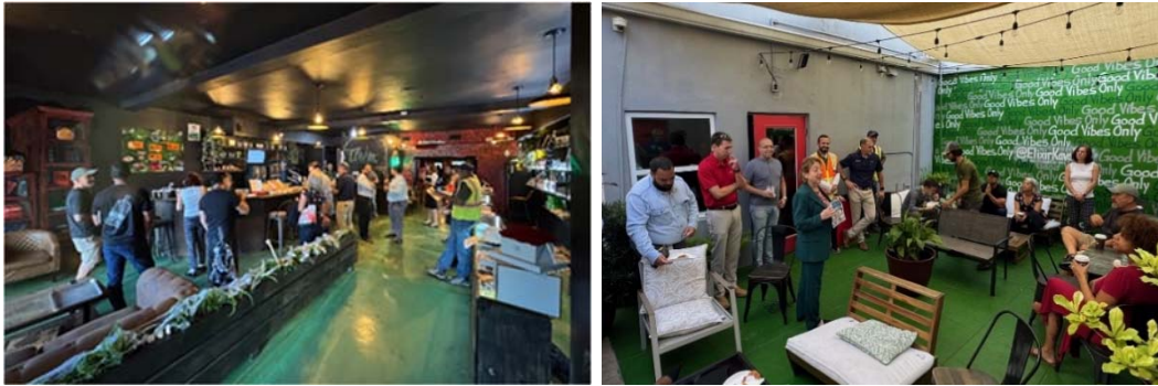
Second "Coffee with the Crew" at 1920 Harrison Street