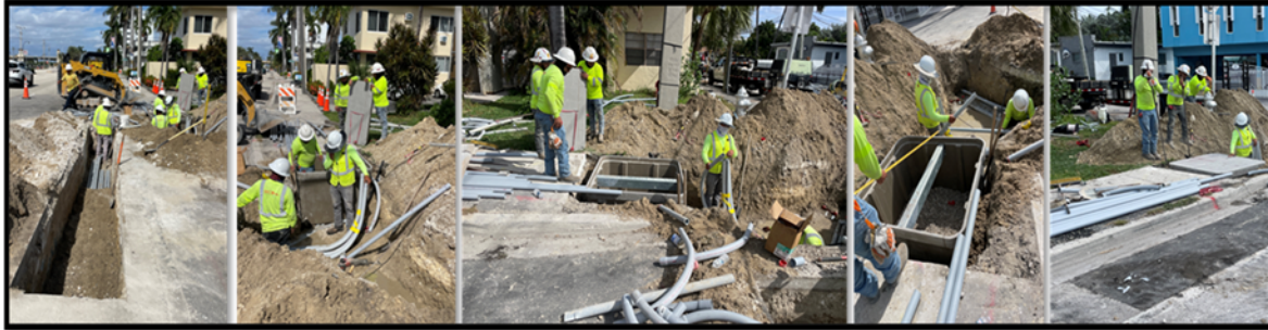
Horizontal Directional Drilling at A1A for electrical infrastructure and undergrounding work