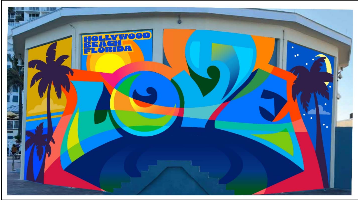
"Lead with Love" sketch (top) and rendering (bottom)

In addition, CRA and CMED staff continue to partner on citywide restaurant promotions. The first launched in January to kick off the City's Centennial Celebration and is focusing on Resident Rewards Wednesdays, a year-round discount program. Over 50 businesses are currently participating, and staff continue to solicit business owners and disseminate information about the program's benefits. The business participation form can be found at https://tinyurl.com/HollywoodRRW . The second program, Dine Out Hollywood, ran from October 15 th to November 15 th , and 15 of the 23 participating restaurants were in the CRA districts.