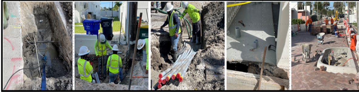
Horizontal Directional Drilling at A1A for electrical infrastructure and undergrounding work.