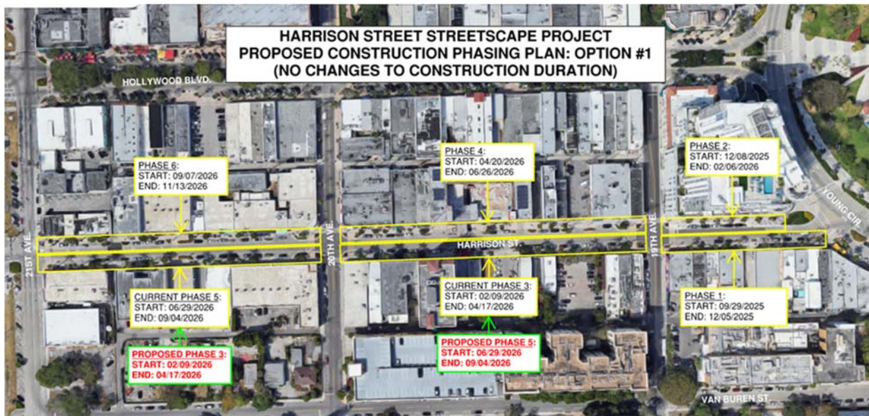
Revised Phasing Plan per Business Community Feedback