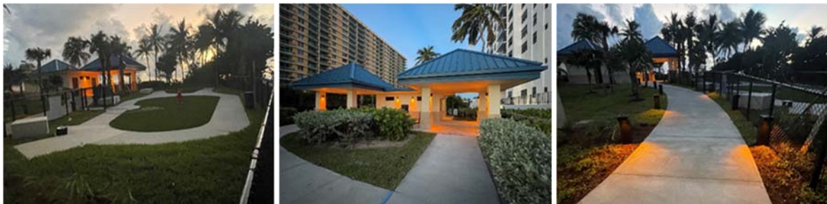
Left to Right: From W Side of Dog Park Looking NE; Keating Park East Facade; View from Main Path Looking East