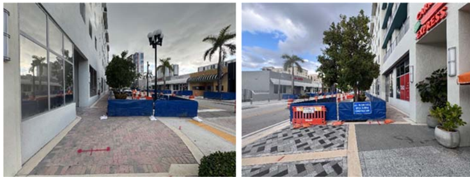
Phase II – MOT Set-up

MOT measures and pedestrian barricades have been installed around the construction zone. Access to all businesses and residences within this phase will be maintained throughout the construction period. During construction hours of 7 AM to 4 PM, Monday to Friday, the westbound lane between 19th Avenue and Young Circle will be closed, but it will reopen at the end of each day once construction activities are complete. The eastbound lane will remain open throughout the construction process. Additionally, parallel parking spaces immediately adjacent to the construction zone will be closed for the duration of the second phase to accommodate staging of materials and construction equipment.