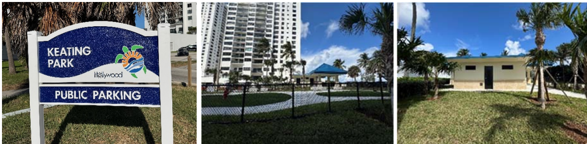
Left to Right: New Keating Park Sign, View from Access Path Looking North, View of West Facade

A substantial completion walkthrough took place on Tuesday, September 30 th . The Contractor, CRA, and City staff completed the walkthrough and staff provided comments to the contractor, who compiled a punch list. The Contractor will finalize the punch list items in the coming weeks and complete the project and permit closeout.