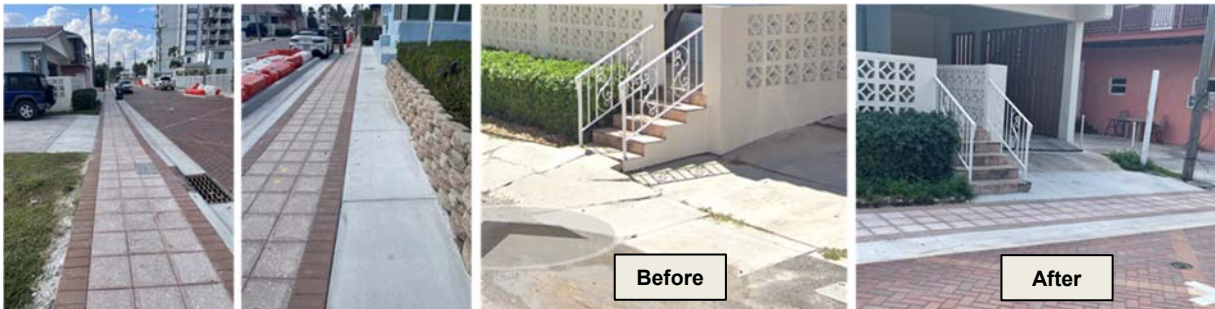
Private property harmonization: adjusting grades to match the elevated road beyond the right of way.

Right-of-entry agreements distributed to approximately 75% of the residents. Most agreements from Harrison to Jackson Streets collected. Harmonization on Van Buren Street has been completed.