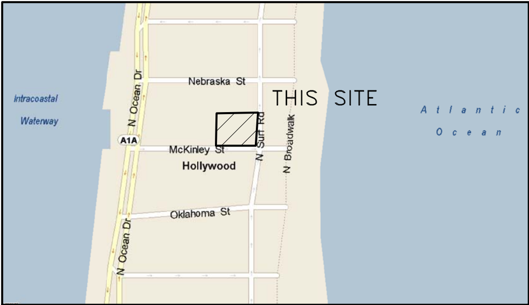
LOCATION MAP (NTS)