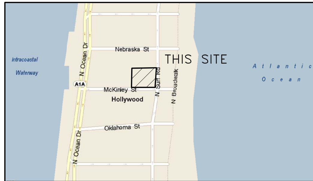
LOCATION MAP (NTS)