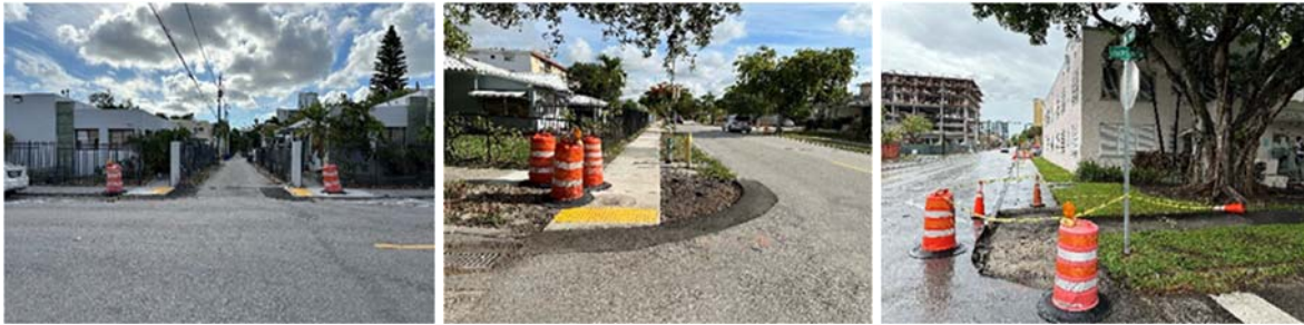
Demolition of ADA ramps and sidewalks, and placement of concrete

The CRA, in partnership with the City's Engineering Division, retained the services of Concrete Works and Paving, Inc. to restore damaged sidewalks and address ADA accessibility along 19 th and 20 th Avenues. The project began on May 28 th and the contractor is currently demolishing and placing concrete along 20 th Avenue between Polk Street and Monroe Street.