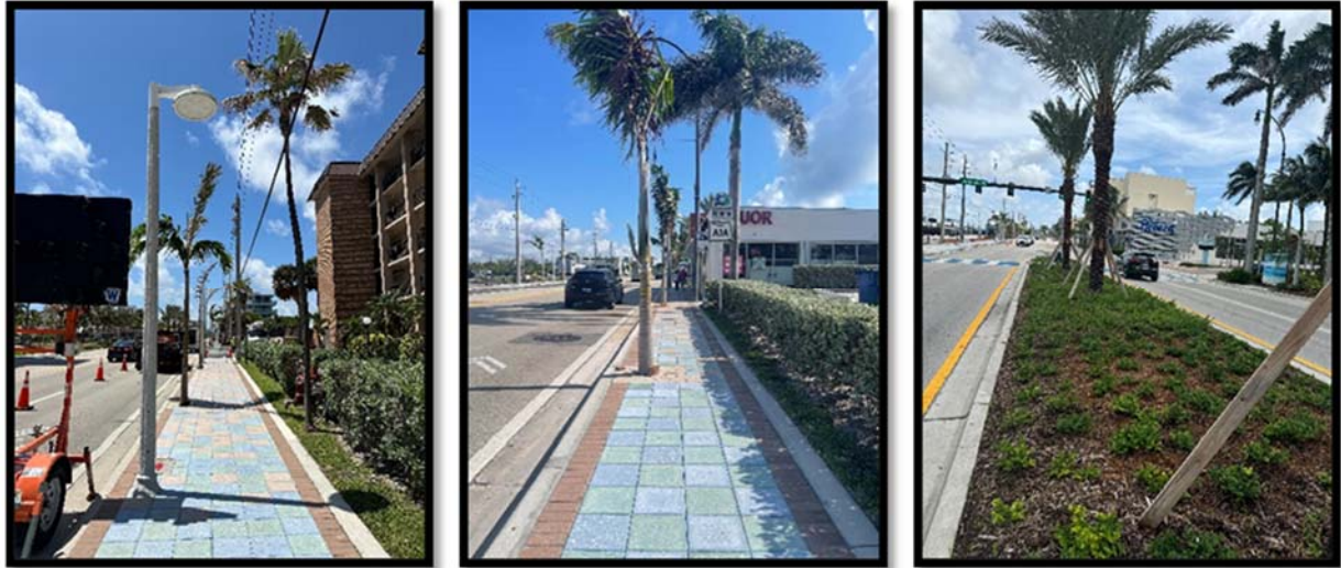
East and West sidewalks landscape and hardscape; Landscape medians