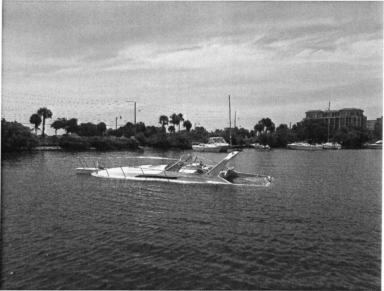
Vessel "Dani's Dream" WELC7320L293