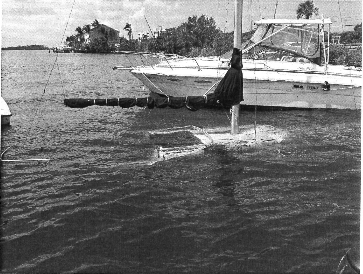
S/V "Wiser" FL2989BU