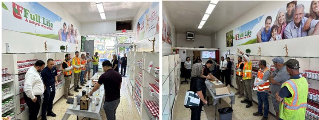
"Coffee with the Crew" Eleven – April 18 th at 1932 Hollywood Blvd.