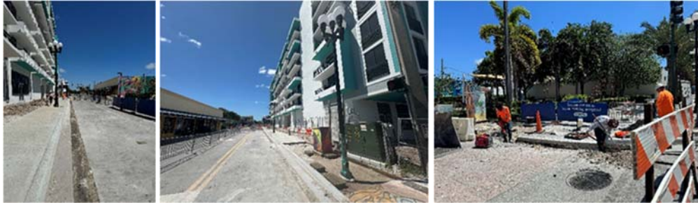
N. 20 th Avenue: West: forming and pouring picture frame concrete and valley gutter; installing new LED lighting. East: Removing existing curb, sidewalk, and electrical; forming new concrete sidewalk; rough-in of electrical.

Demolition of the existing ROW is 60% complete. The installation of the new stormwater system is complete. The contractor began forming and placing the new valley gutter and curb islands; began forming tree pits; began installation of the new conduit; installed new bollards and new LED light poles; began planting of new medjool date palms; continued excavating and pouring 12" radius curbs; and poured flowable fill in sidewalk areas in preparation for paver installation.