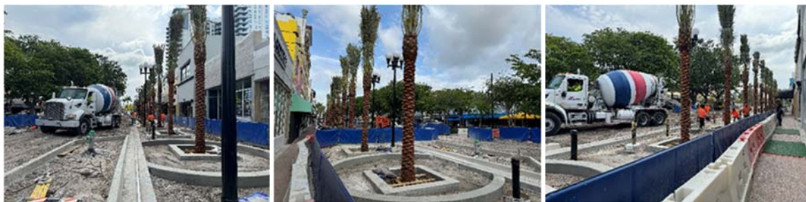
S. Hollywood Boulevard: forming and pouring tree pits; installing new trees, LED lighting, and bollards.