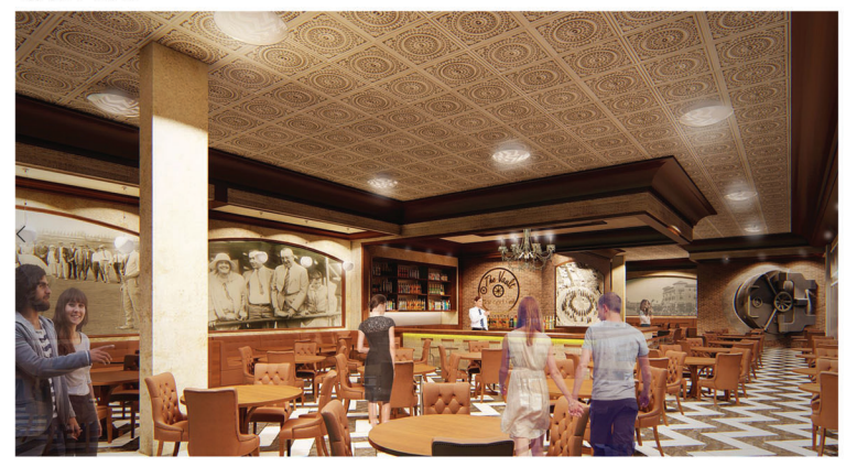
Vault and Interior Restaurant