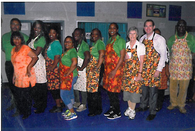
Volunteers donned colorful aprons to serve residents who came out for CEC's annual Harvest Fest.