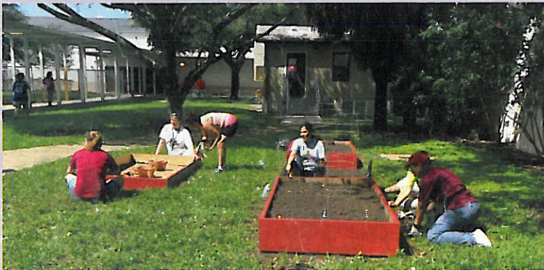
Volunteers and teachers install new planter beds.