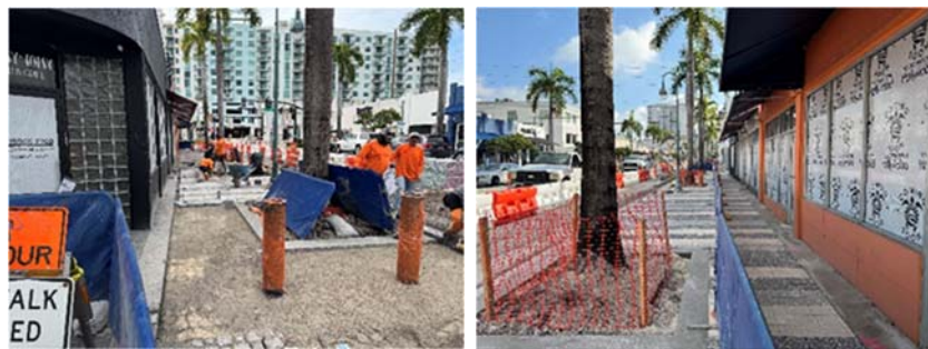
Phase III – Paver and bollard installation

Selective demolition activities are currently ongoing. Forming and placement of tree pits are complete. Paver and bollard installation has begun at the west end. The contractor received a shipment of new light poles and bases, and started the removal and installation along the east end of the project.