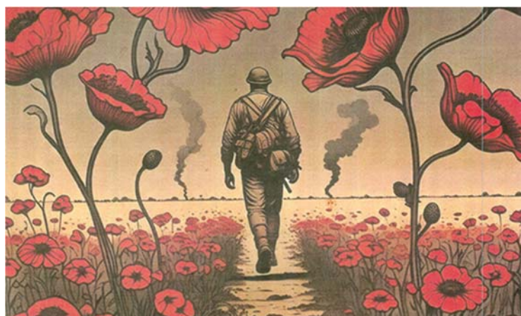
First mural concept for the American Legion Post 92

At the November 5, 2025, CRA Board meeting, the Board voted unanimously to provide $11,250 to the American Legion Post 92 for the removal of the existing mural and the installation of a new mural. A Code violation was issued in October because portions of the wall were deteriorating, resulting in exposed elements and safety concerns. The wall has since been repaired. The first design submitted by the American Legion featured a soldier in a field of Corn Poppies.