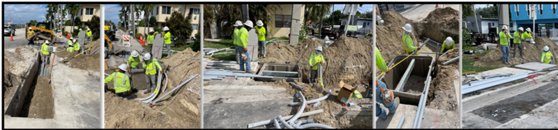
Horizontal Directional Drilling at A1A for electrical infrastructure and undergrounding work

Horizontal directional drilling for conduit main service line is being installed along SR A1A. An FDOT single lane closure is approved daily from 9:00AM to 4:00PM in areas of ongoing work. Contractor completed the directional boring and is excavating, pulling back and tie-in, private service layout, from Harrison to Jefferson Street. Currently, conduit installation has been completed from Harrison Street to Jefferson Street with the East/West streets. Due to the pump construction from Jefferson Street to Crocus Terrace, the contractor has moved south to Foxglove Terrace, where a single lane closure has been established to begin the horizontal directional drilling on the south side towards Hallandale Beach Blvd.