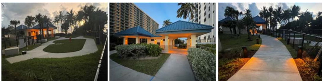
Left to Right: From W Side of Dog Park Looking NE; Keating Park East Facade; View from Main Path Looking East