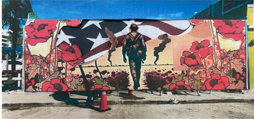
Second mural concept for the American Legion Post 92

These two designs were reviewed by the Mural Review Committee. The Committee favored the first design but deferred the final decision to the CRA Board. The day before the Board Meeting, the American Legion 92 submitted a third design concept that featured the soldier, poppies, flag, and a “Soldier’s Cross.”