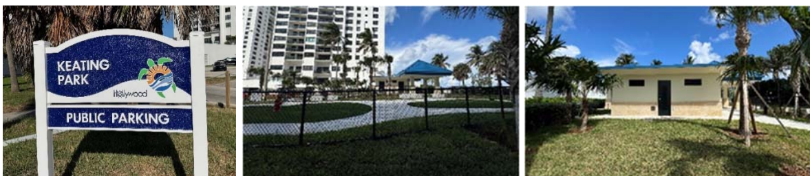
Left to Right: New Keating Park Sign, View from Access Path Looking North, View of West Façade