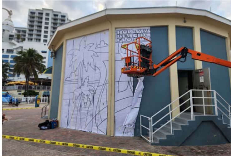
"Lead with Love" sketch being installed