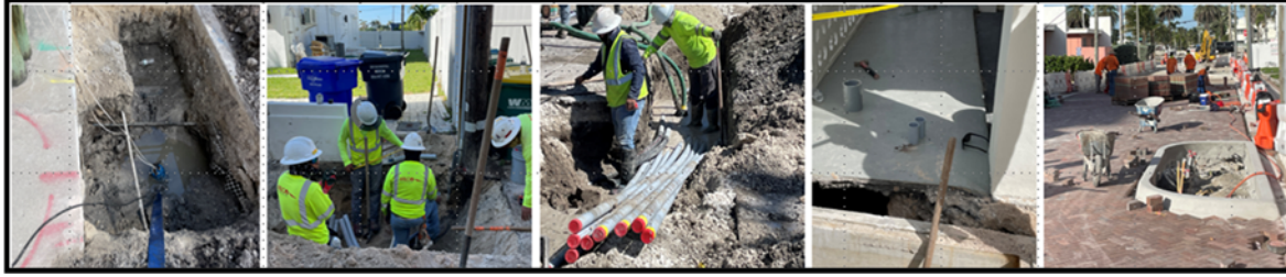
Horizontal Directional Drilling at A1A for electrical infrastructure and undergrounding work.