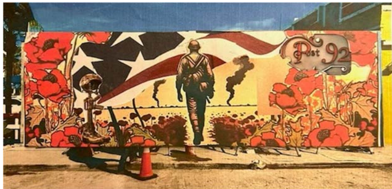
Third mural concept for the American Legion Post 92

These two designs were reviewed by the Mural Review Committee. The Committee favored the first design but deferred the final decision to the CRA Board. The day before the Board Meeting, the American Legion 92 submitted a third design concept that featured the soldier, poppies, flag, and a “Soldier’s Cross.”