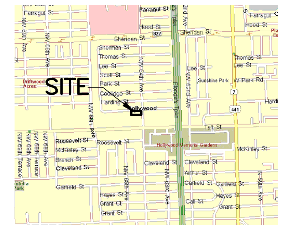
LOCATION SKETCH (NO SCALE)

DESCRIPTION: THE EAST 300 FEET OF THE NORTH 100.64 FEET OF TRACT 'B' OF "DRIFTWOOD PLAZA", ACCORDING TO PLAT THEREOF AS RECORDED IN PLAT BOOK 49, PAGE 26, OF THE PUBLIC RECORDS OF BROWARD COUNTY, FLORIDA.