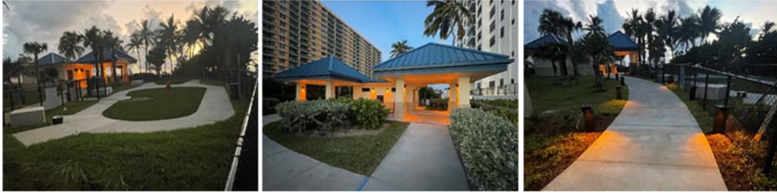
Left to Right: From W Side of Dog Park Looking NE; Keating Park East Facade; View from Main Path Looking East