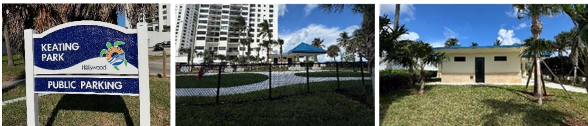
Left to Right: New Keating Park Sign, View from Access Path Looking North, View of West Facade

A substantial completion walkthrough took place on Tuesday, September 30 th . The Contractor, CRA, and City staff completed the walkthrough and staff provided comments to the contractor, who compiled a punch list. The Contractor finalized the punch list. CRA Staff, the Architect of Record and the Contractor are working on completing permit closeout items related to Broward County, FDEP and FWC.