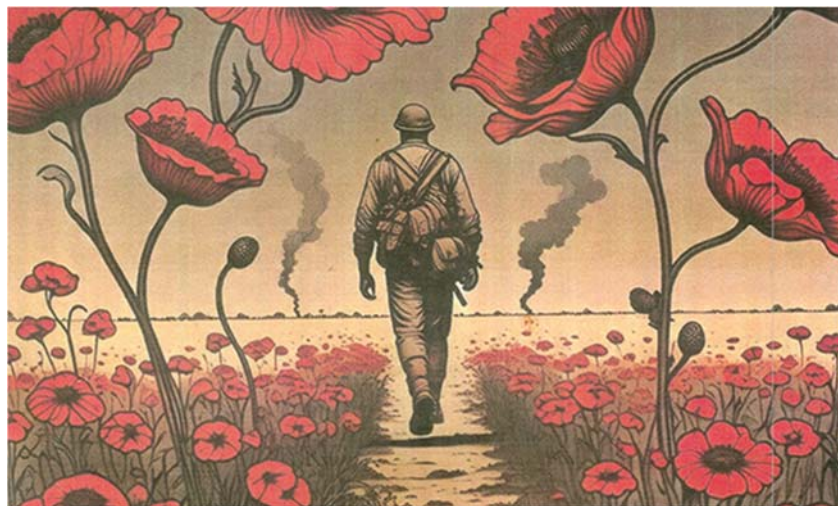
Proposed mural concept for the American Legion Post 92

At the November 5, 2025, CRA Board meeting, the Board voted unanimously to provide $11,250 to the American Legion Post 92 for the removal of the existing mural and the installation of a new mural. A Code violation was issued in October because portions of the wall were deteriorating, resulting in exposed elements and safety concerns. The wall has since been repaired. The new mural design features the Corn Poppy, a powerful symbol of remembrance. The design concept will be presented to the Mural Review Committee and the CRA Board.