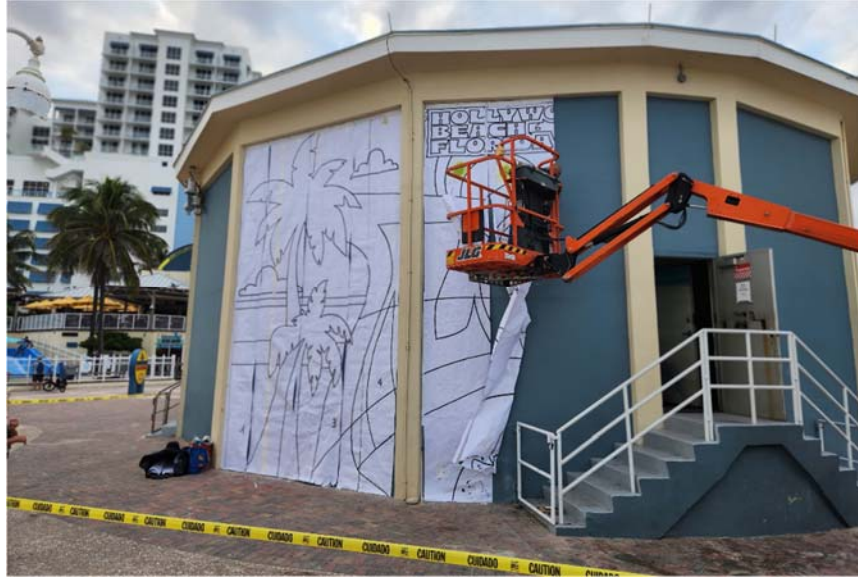
"Lead with Love" sketch being installed

At the November 5, 2025, CRA Board meeting, the Board voted unanimously to provide $11,250 to the American Legion Post 92 for the removal of the existing mural and the installation of a new mural. A Code violation was issued in October because portions of the wall were deteriorating, resulting in exposed elements and safety concerns. The wall has since been repaired. The new mural design features the Corn Poppy, a powerful symbol of remembrance. The design concept will be presented to the Mural Review Committee and the CRA Board.