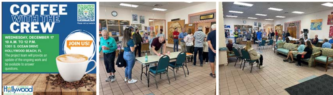
December 17 th Coffee with the Crew at the Hollywood Beach Culture and Community Center

On December 17 th , Coffee with the Crew was held at the Hollywood Beach Culture and Community Center. 37 residents attended. FDOT representatives were present to provide an update on the pump station construction. The contractor and CRA team discussed a wide range of topics, among them resiliency, right of entry agreements, construction schedule, and temporary parking among others. The CRA Executive Director remained after the meeting for a brief informational discussion on future development with a group of residents.