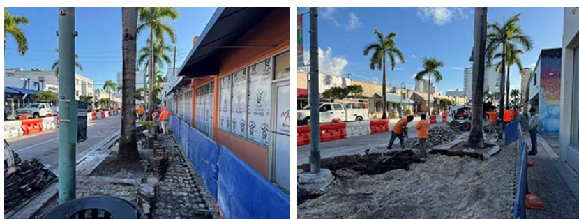
Phase III – Demolition

Demolition activities along Phase III commenced on January 5 th , 2026.