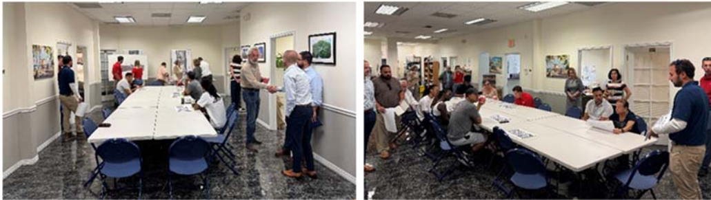
Third "Coffee with the Crew" at the CRA office, 1948 Harrison Street