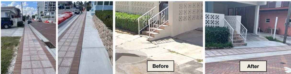
Private property harmonization: adjusting grades to match the elevated road beyond the right of way.

Right-of-entry agreements distributed to approximately 75% of the residents. Most agreements from Harrison to Jackson Streets collected. Harmonization on Van Buren Street has been completed. Finish work at joint locations is scheduled for the end of the month.