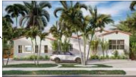
1415 Madison Street