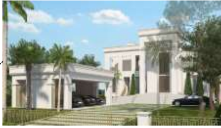
1010 South Northlake Drive