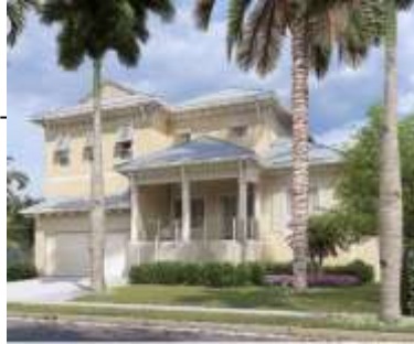
728 Harrison Street