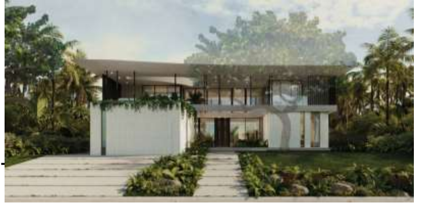
1015 S. Southlake Drive