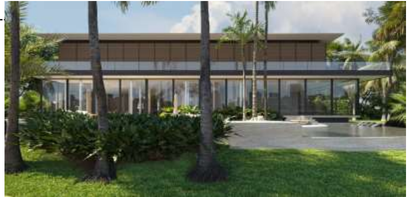
914 S. Southlake Drive