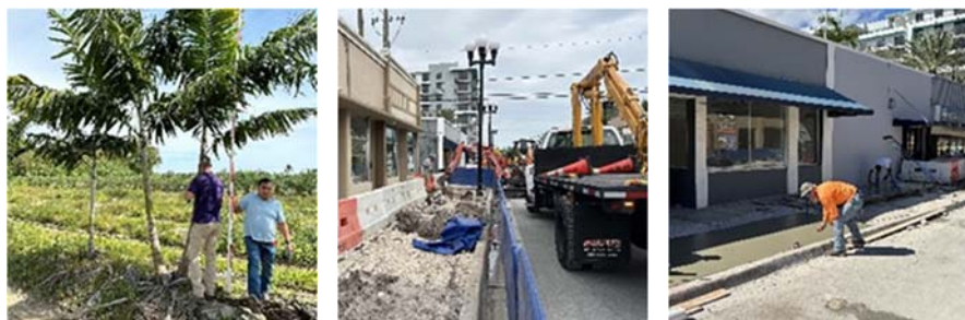
S. 20th Avenue: Tree tagging, lighting installation, and picture-frame sidewalks

N. 19th Avenue: on February 2nd, 2024, the contractor set up MOT and began the demolition of the existing sidewalk. The electrical and irrigation rough-in is ongoing. Replanting of existing Medjool Palms is complete. The contractor began the installation of the new LED Lights.