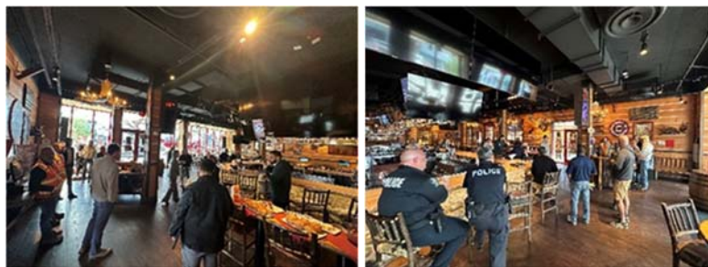
"Coffee with the Crew" Nine – February 22 nd at 1903 Hollywood Blvd.