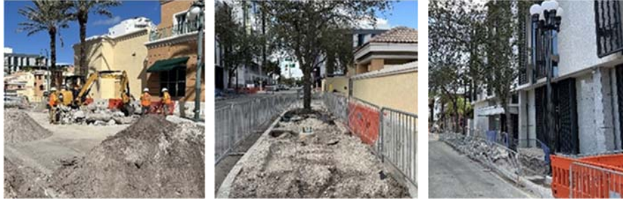
N. 19th Avenue: MOT and demolition