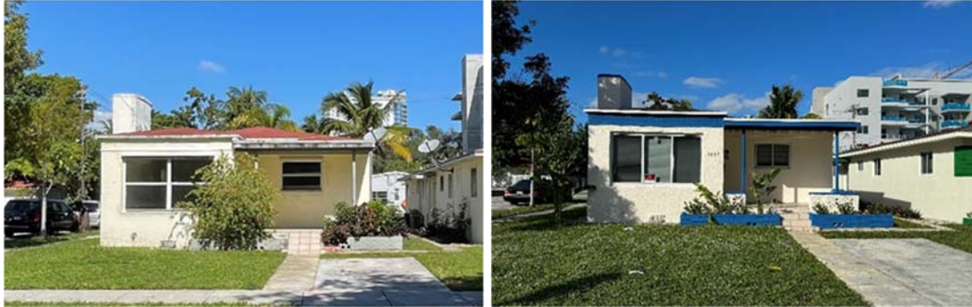
1857 Madison Street Before & After Improvements

Owners of 1857 Madison Street completed a PIP Grant; the comprehensive improvements to the property included new exterior painting and stucco, new impact windows and doors, and new roof.