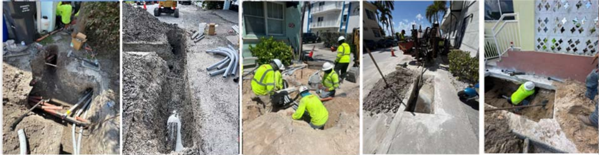
Undergrounding and electrical infrastructure installation, private property conduit runs