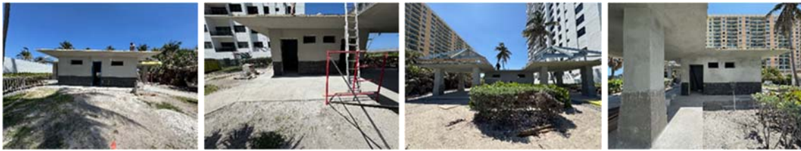
From Left to Right: West elevation; south elevation; east elevation; north elevation.

The contractor has finalized installation of the roof steel structure and continues to work on the roofing steel and fascia framing. Installation of the corrugated roof panels and roofing inspections to follow.