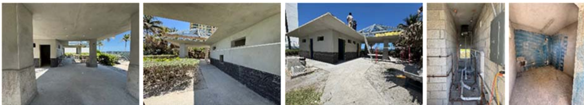
From Left to Right: south façade & pavilion stucco, east façade stucco, west & south facades stucco, plumbing chase rough installation, west restroom plumbing rough installation & water proofing.

The contractor has finalized the installation the dense glass sheeting, lath, and stucco throughout the façade, painting of the stucco to follow. The lower third of the façade has been prepared to receive the coquina cast stone finish similar to pre-cast on the Broadwalk knee wall, streetend details, and Charnow Park. The contractor is finalizing the plumbing rough installation, plumbing fixture installation, and finishes to follow.