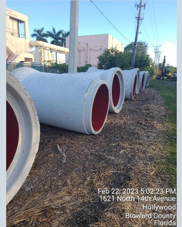
New RCP with protective coating