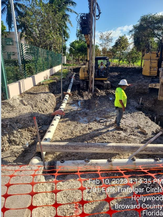
Installing dewatering well point system