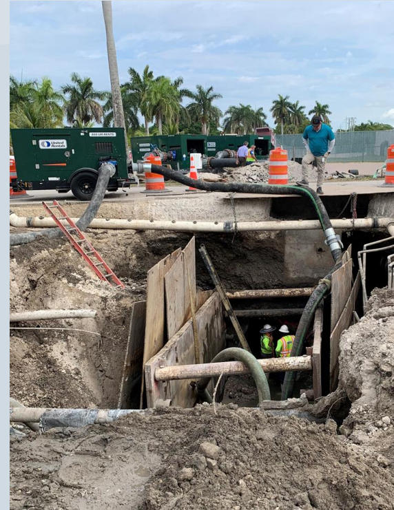
Removal of the broken pipe