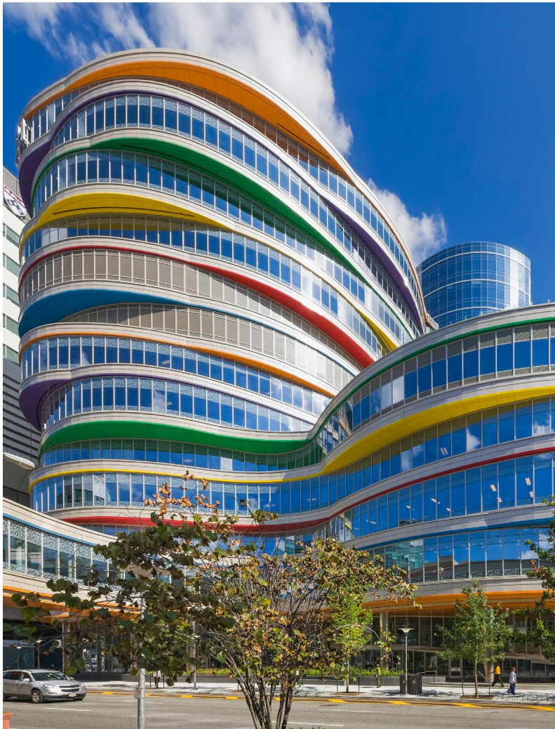
Children's Hospital of Philadelphia, Buerger Center for Advanced Pediatric Care Philadelphia, Pennsylvania