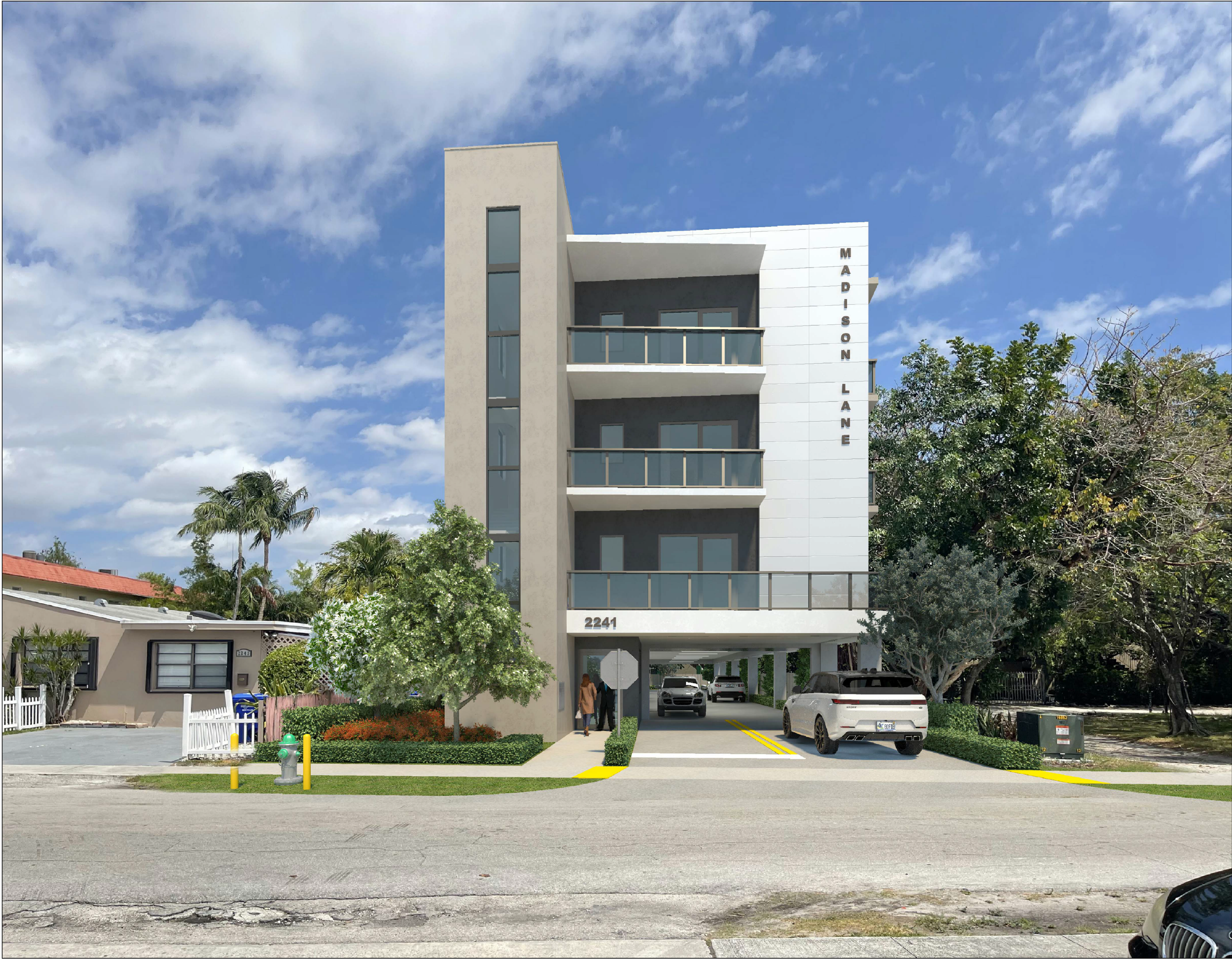
RENDERING OF THE PROPOSED BUILDING FROM MADISON ST