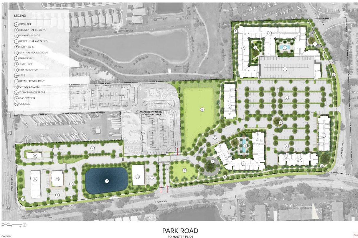
Figure 1: Conceptual Master Plan

A conceptual master land use plan is provided, Figure 1, illustrating the envisioned layout. It should be noted that the building and garage configurations are subject to adjustments and modifications, provided they comply with the requirements of the Park Road PD and City of Hollywood Code of Ordinances, as applicable.