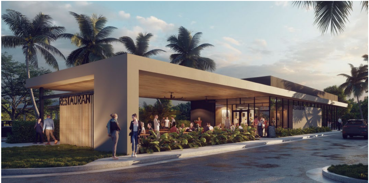
Outdoor seating areas enhance the overall appeal of the development by creating dynamic, multi-functional environments that encourage foot traffic and support local businesses.

Restaurants proposed within the PD should include enhanced facilities that offer covered seating areas, integrated landscaping, and comfortable pedestrian access points. Restaurants that front the peripheral public right of ways should be accompanied with outdoor seating areas.