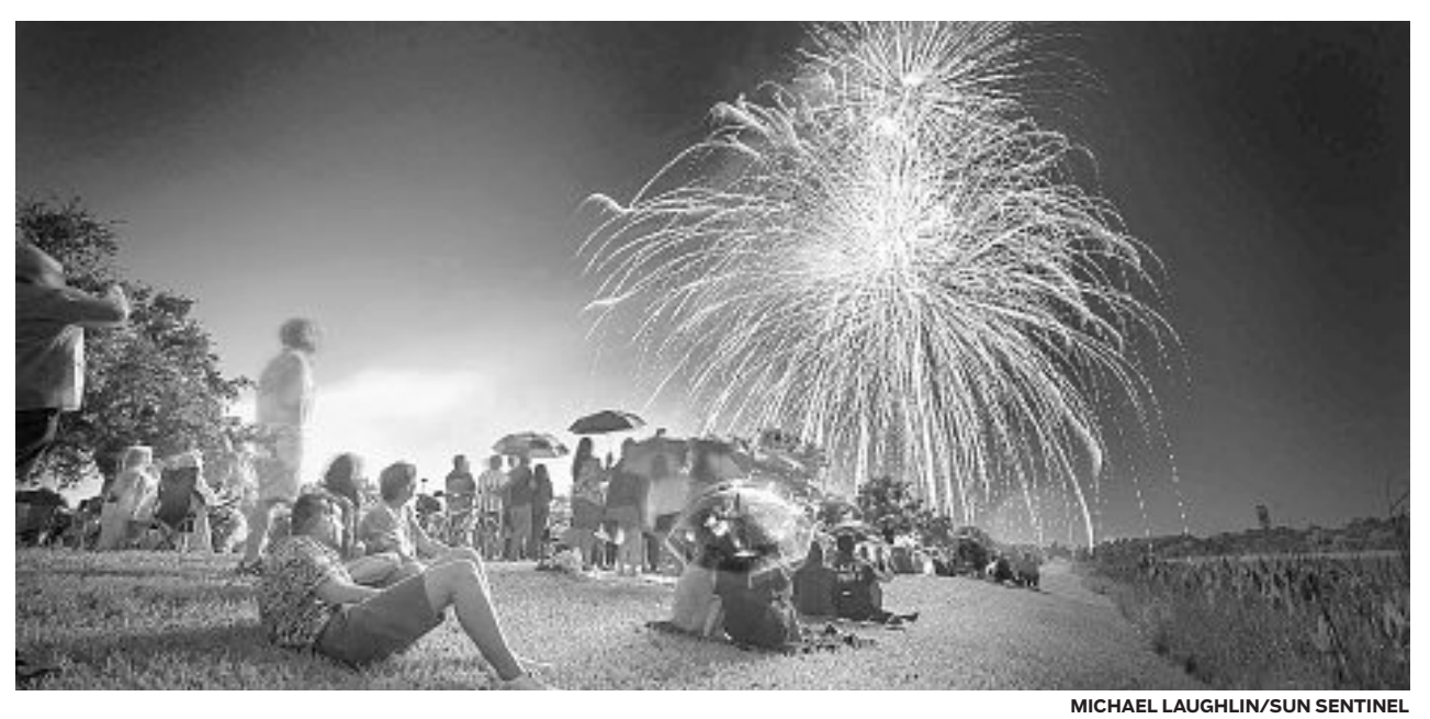
A large crowd watches fireworks pop in the sky above Boca Raton's Countess De Hoernle Park in 2018.

Fourth of July Parade and Fireworks , 10 a.m.-9 p.m. The parade will be along El Mar Drive between Pine and Hibiscus Avenues, starting on Bougainvillea Drive and ending at Hibiscus Avenue. Family activities 11 a.m.-3 p.m., include face painting, a water slide, music, food, a clown and equipment dem-