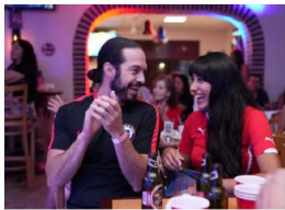
Viva Chile Lindo