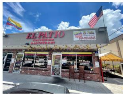
El Patio Colombian Restaurant