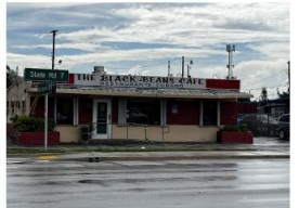
The Black Beans Café