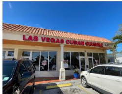
Las Vegas Cuban Cuisine