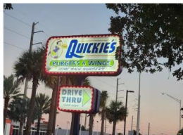
Quickie's Burgers & Wings