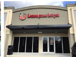
Lemon Grass Hot Pot