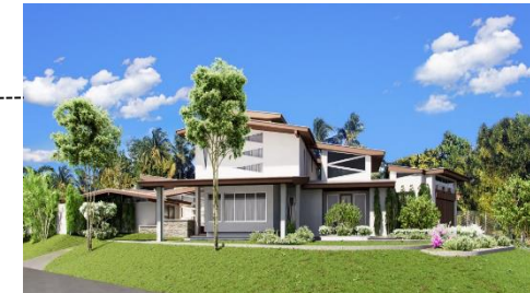
1051 S Northlake Drive