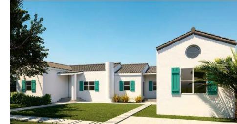
856 Tyler Street