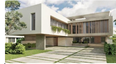
927 N Northlake Drive