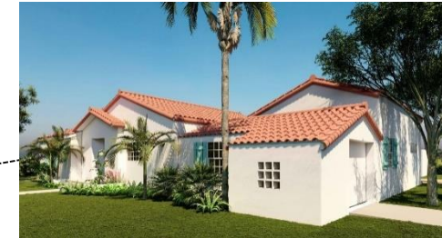
1010 Tyler Street