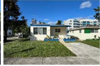
1857 Madison Street – Before & After