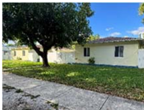
1829 Madison Street – Before & After