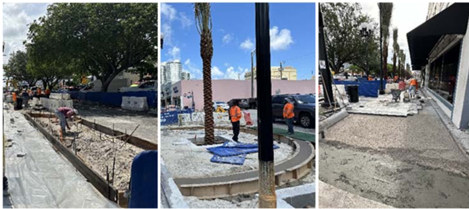
S. Hollywood Blvd, 20 th & 21 st Ave: Forming landscape islands, pouring circular banding, and paver installation.

The valley gutter installation is complete. The electrical rough-in, and installation of light fixtures/poles, and festoon poles are complete. New irrigation system and Medjool Palm planting is complete. Installation of sidewalk pavers is complete. PaveDrain installation along new parallel parking spaces is 80% complete. Planting of landscape islands will take place closer to the end of project.