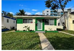
1853 Madison Street – Before & After