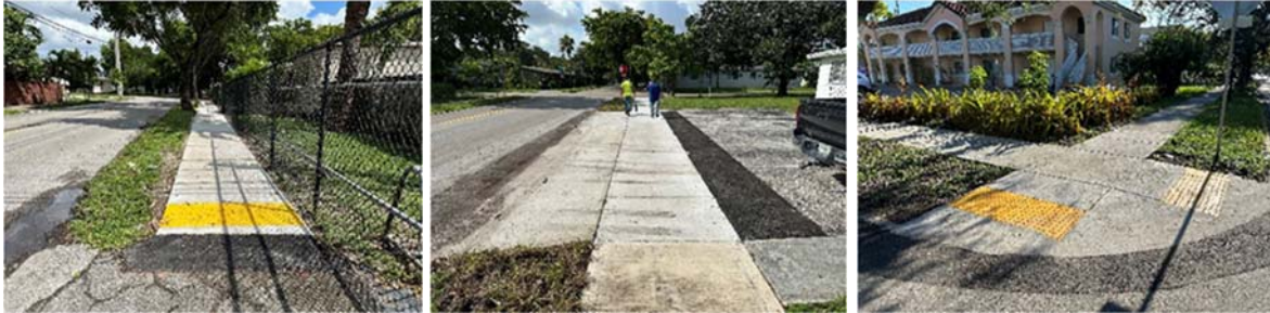
ADA ramps and sidewalks placement is substantially complete

The CRA, in partnership with the City's Engineering Division, retained the services of Concrete Works and Paving, Inc. to restore damaged sidewalks and address ADA accessibility along 19 th and 20 th Avenues. The project is substantially complete. The Contractor is pending sod restoration along 19 th Avenue.