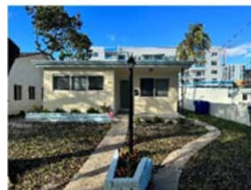
1847 Madison Street – Before & After