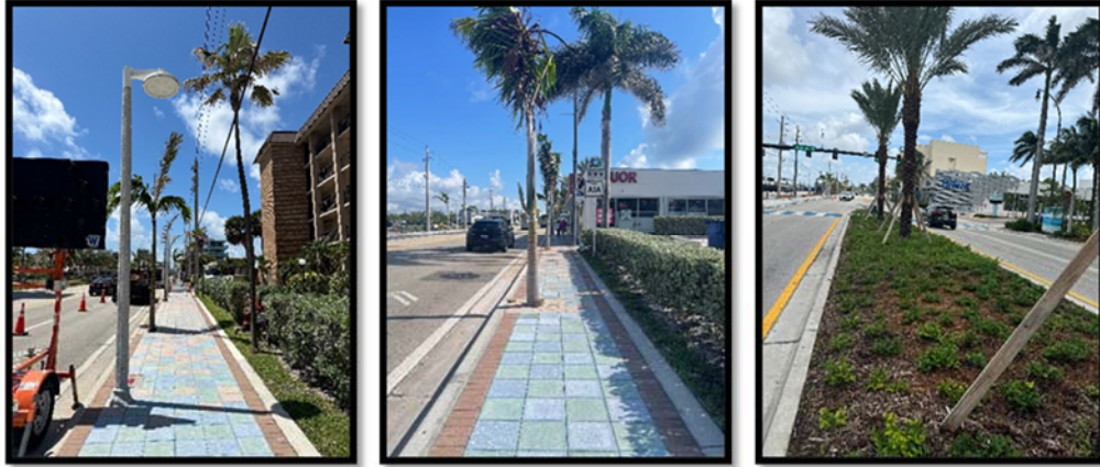
East and West sidewalks landscape and hardscape; Landscape medians