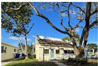
1849 Madison Street – Before & After