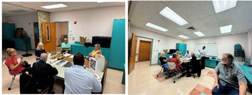
August 13, 2024 Paint Only Program Workshop

On August 6 and 13, 2024 the CRA hosted workshops with beach residents. CRA Staff and architectural firm Song + Associates sat with residents to assist with color section for their property, and to fill out application documents.