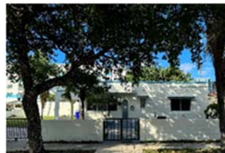
1833 Madison Street – Before & After