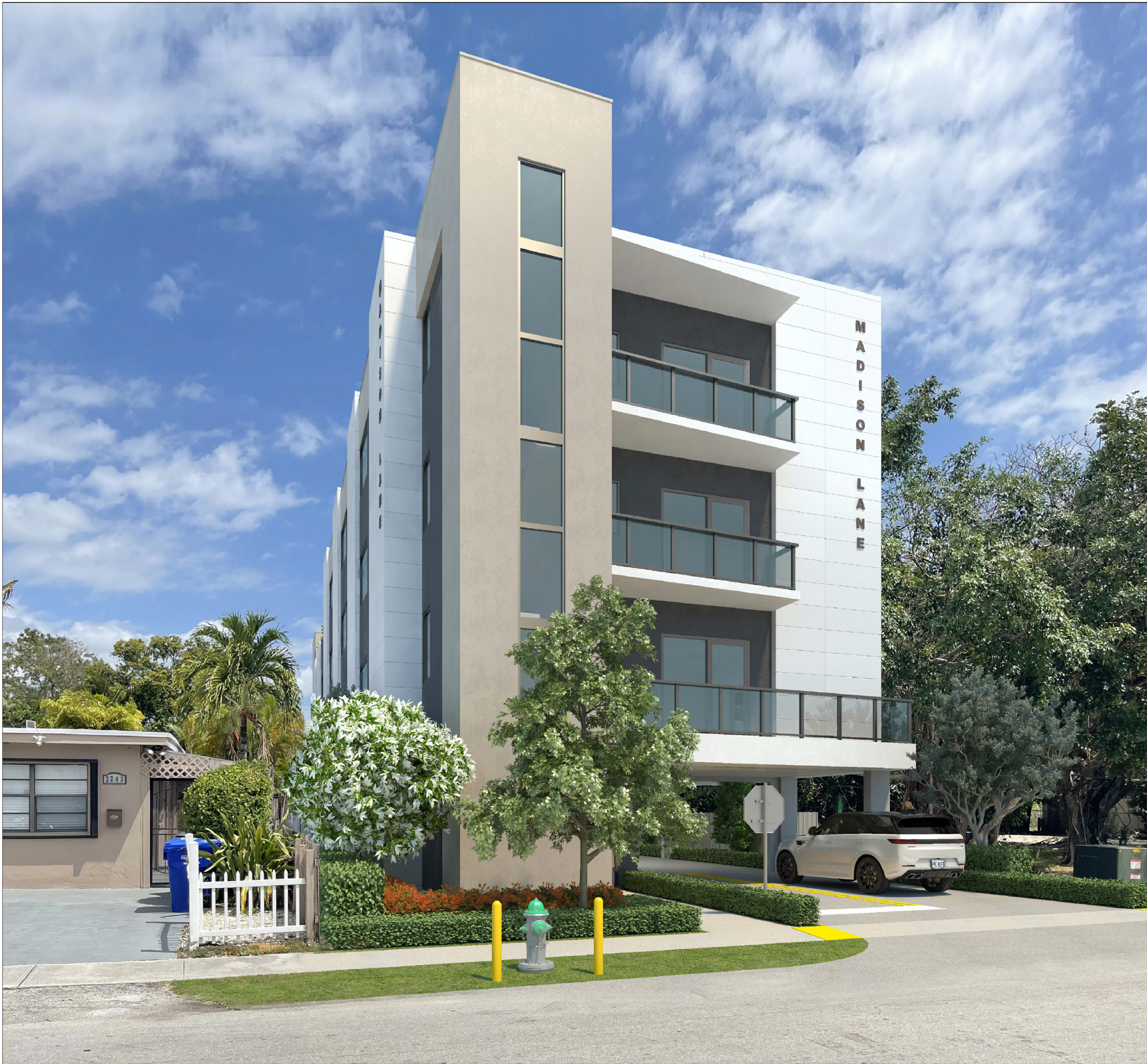
RENDERING OF THE PROPOSED BUILDING FROM MADISON ST