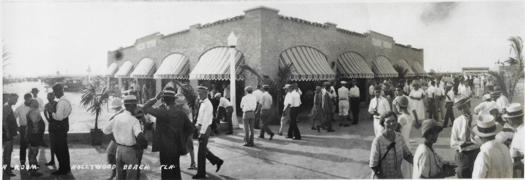
H. ROOM. HOLLYWOOD BEACH. FLA.