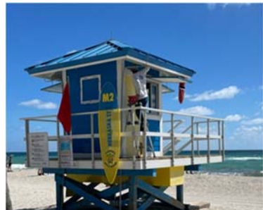
Nebraska Street LGT