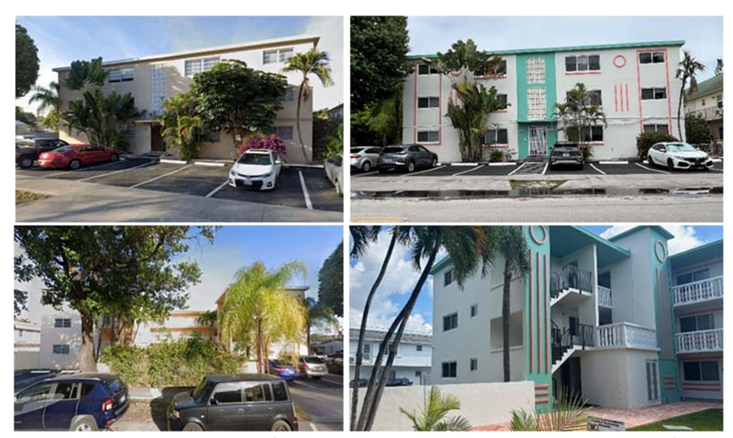
Photos from Top - Bottom (1857 Jefferson Street Before & After Improvements)

Owners of the 1857 Jefferson Street completed a PIP Grant; the comprehensive improvements included new paint and stucco, new impact windows and doors, asphalt resurfacing and restriping of their parking areas, the property owner installed pavers in the courtyard and made landscaping improvements outside of their grant.