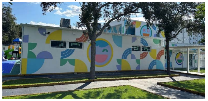
Completed mural at 1704 Buchanan Street.

A mural by artists AMLgMATD was completed at Nana's Preschool, 1704 Buchanan Street.