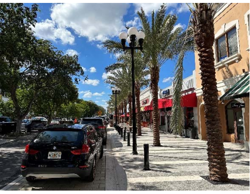
Phase 2 Substantially Completed