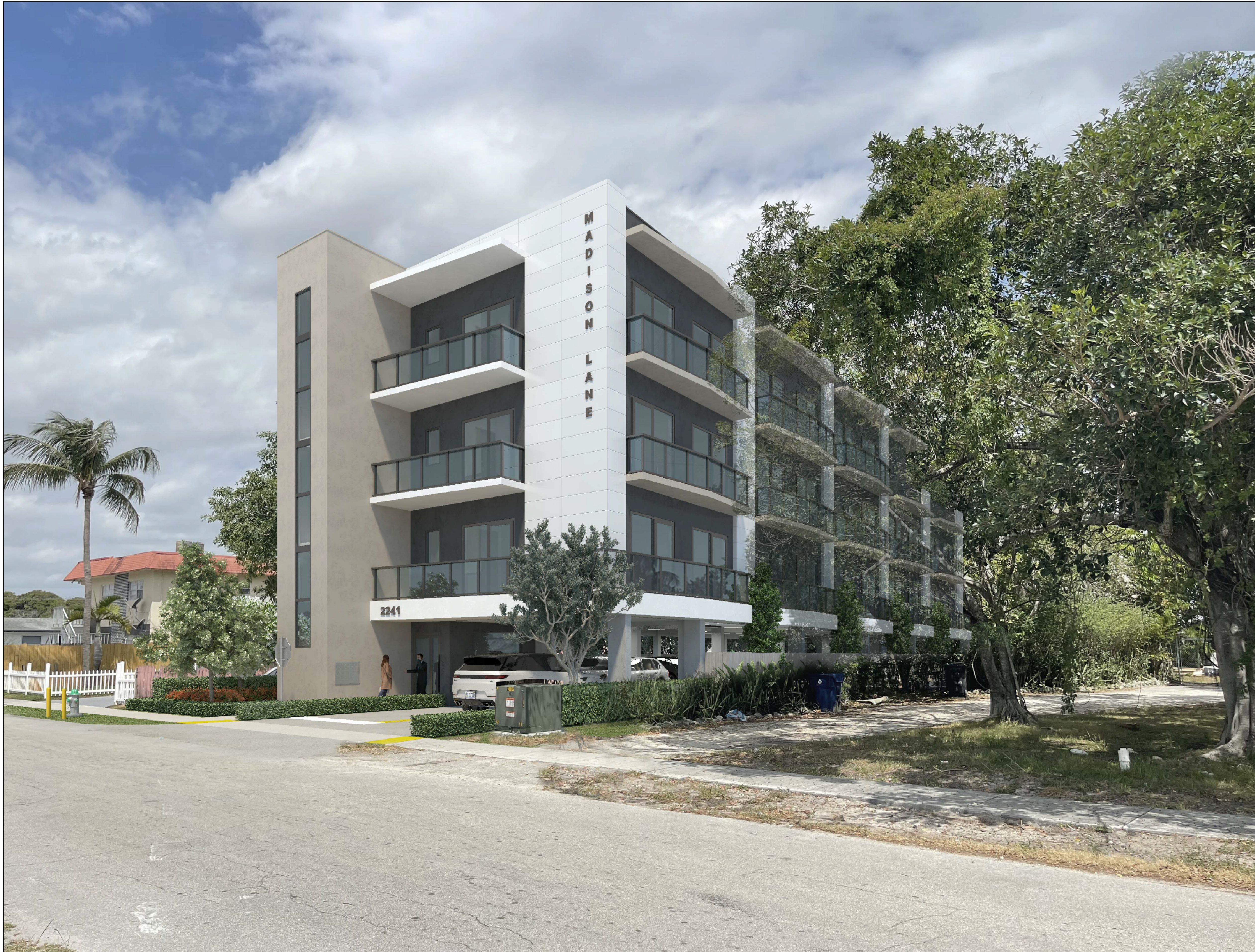
RENDERING OF THE PROPOSED BUILDING FROM MADISON ST