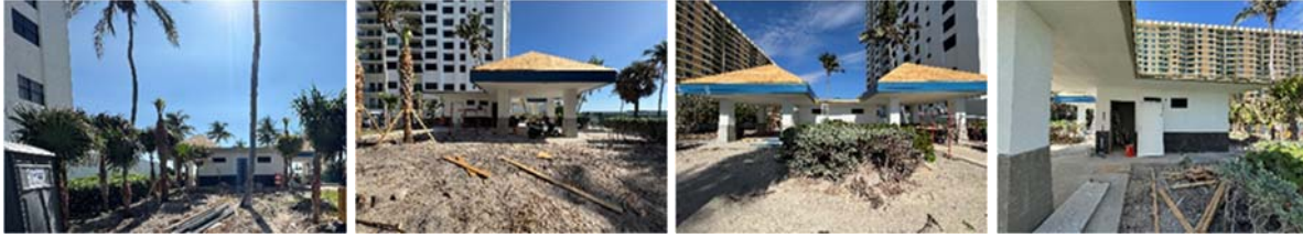
From Left to Right: West elevation; south elevation; east elevation; north elevation.