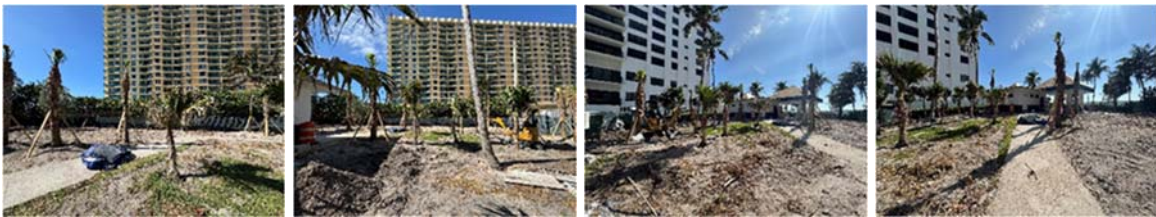
Various views of the relocation of all planting material that was in the proposed dog park area.

The contractor is working on implementing coquina cast stone finish on the lower third of the façade similar to pre-cast on the Broadwalk knee wall, Streetends details, and Charnow Park.