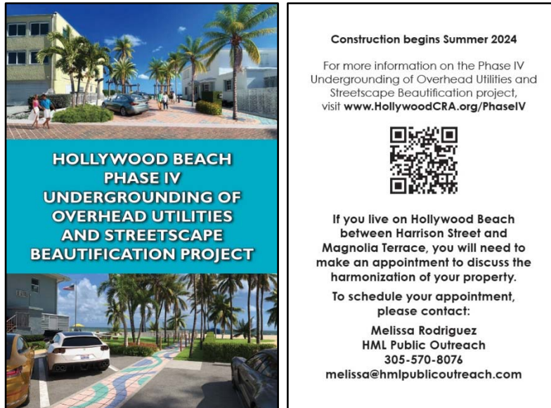
Phase IV information card

The CRA continues to implement and monitor the revised Media Plan focusing on the dissemination of slum clearance and community redevelopment information.