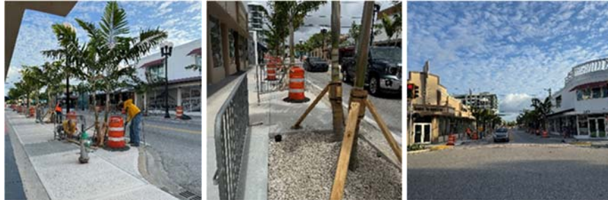
S. 20th Avenue: Landscape installation and prep for flexi-pave. Segment is 90% complete.

Demolition of the existing ROW is 40% complete. The installation of the new stormwater system is complete. The contractor began forming and placing the new valley gutter and curb islands, began forming tree pits, and began installation of the new conduit.