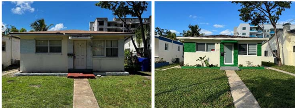
1853 Madison Street Before & After Improvements

Owners of 1853 Madison Street completed a PIP Grant; the comprehensive improvements to the property included new exterior painting and stucco, new impact windows and doors, and new roof.