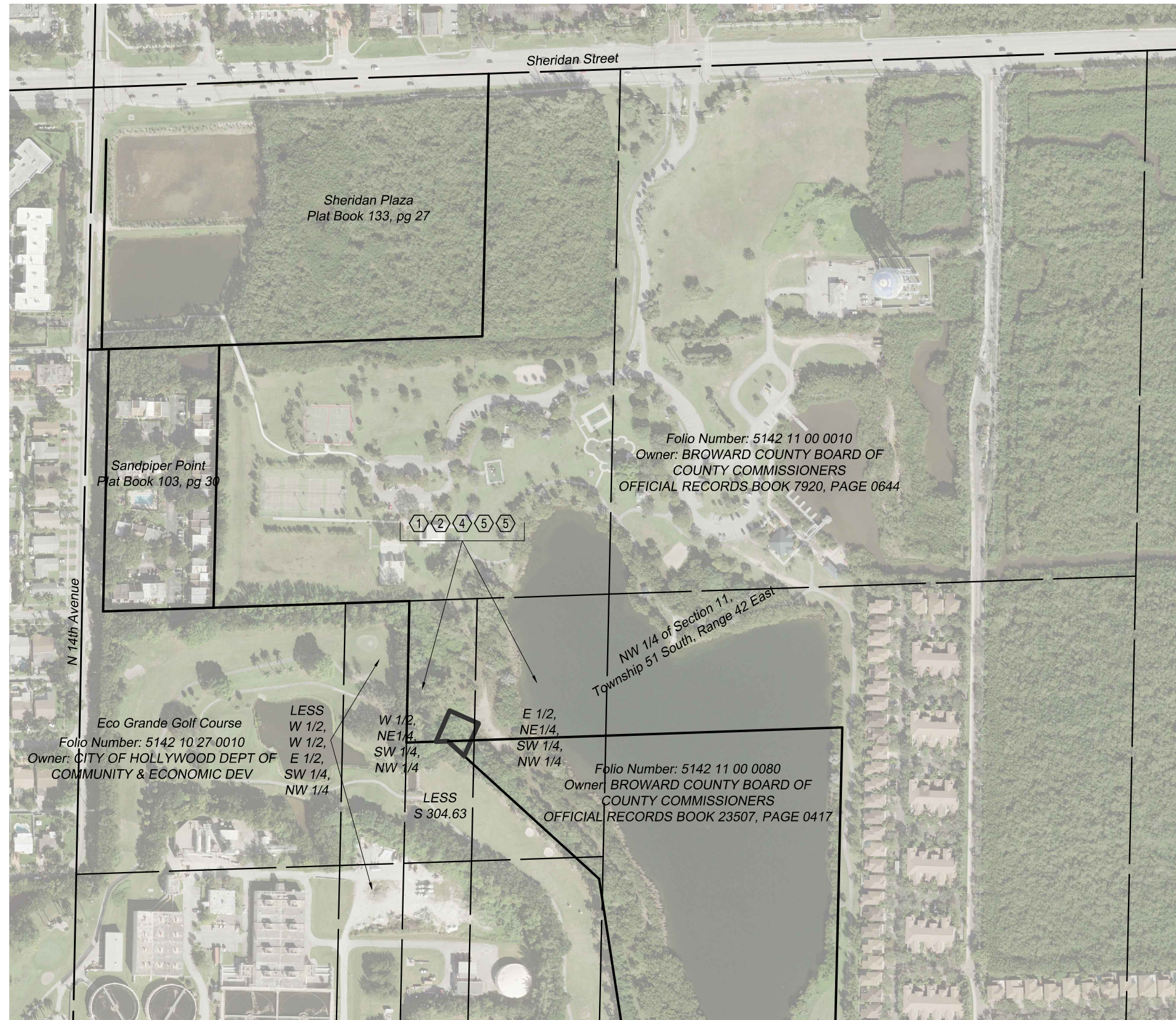
Section 11, Township 51 South, Range 42 East, Broward County, Florida