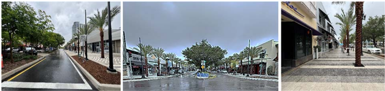
S. Hollywood Blvd, 19 th & 20 th Ave: Installation of tree pits, new trees, LED lighting, bollards, and pavers are complete.

The south side of the Boulevard was substantially completed and reopened to the public and vehicular traffic on May 24 th .