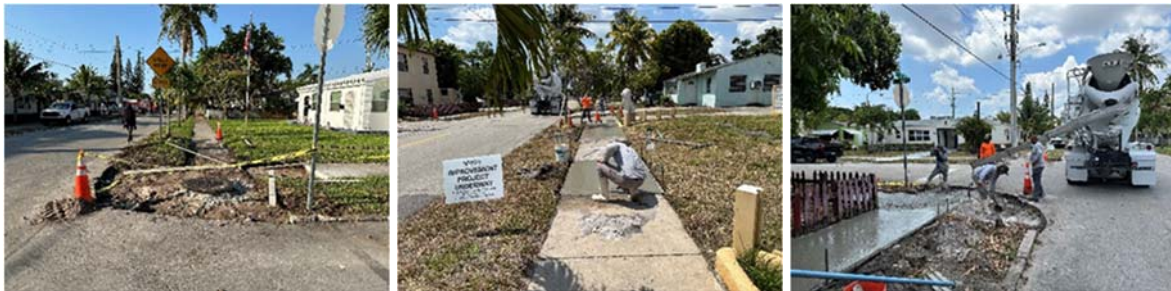
Demolition of ADA ramps and sidewalks, and placement of concrete

The CRA, in partnership with the City's Engineering Division, retained the services of Concrete Works and Paving, Inc. to restore damaged sidewalks and address ADA accessibility along 19th and 20th Avenues. The project began on May 28th and the contractor is currently demolishing and placing concrete along 20th Avenue between Johnson Street and Buchanan Street.