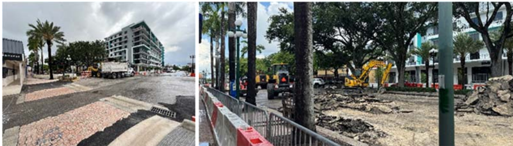
S. Hollywood Boulevard, 20 th & 21 st Ave: Demo of existing roadway, curb, and gutter.

Demolition of the existing ROW has begun. Demolition of the existing roadway, curb and gutter, and sidewalk are taking place.