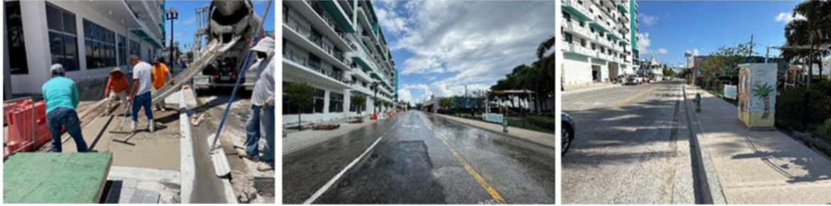
N. 20 th Avenue: installation of picture frame concrete, valley gutter, and new LED lighting are complete.