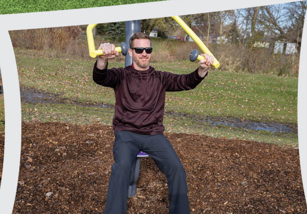
INVIGORATE® CHEST PRESS